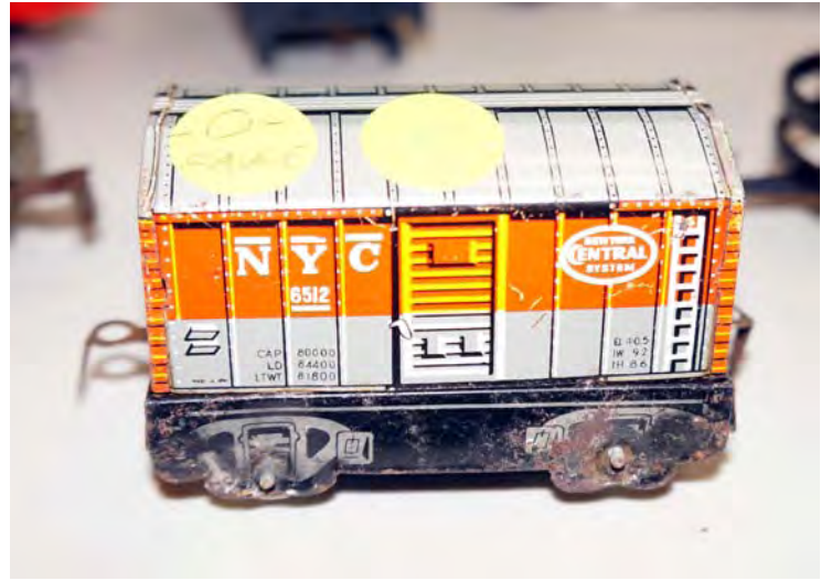
NOT trick photography, you just never know what will show up at a Meet

The 60 th TCA National Convention Philadelphia, PA