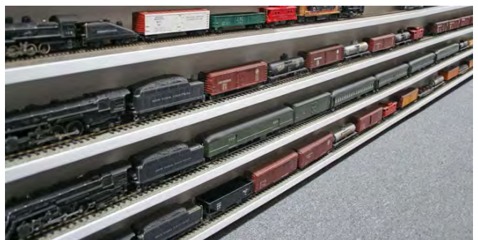
Photo 8 - Scale Craft trains with Lionel OO gauge Hudsons. The passenger train has all Scale Craft cars

Finally, back to my new gift. It has now a place on my display shelves as a living symbol, not only of the history of our hobby, but how so many elements of are tied together.