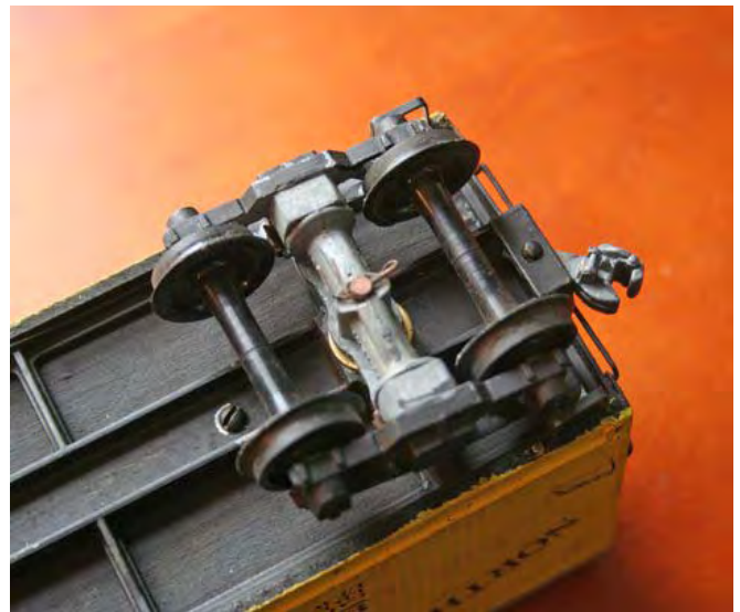
Photo 6 - Reefer trucks and coupler

But, back to Scale Craft. In addition to their "Lionel" four cars, they offered a full line of kits in OO scale. My favorite is a baggage car and coach. These are of die cast metal and are of equal in quality to the cast freight cars - and in my opinion of a quality equal to anything produced in the next 50 years. The doors open and the stairwell traps even fold back to let OO scale passengers climb into the car! (Photo 7)