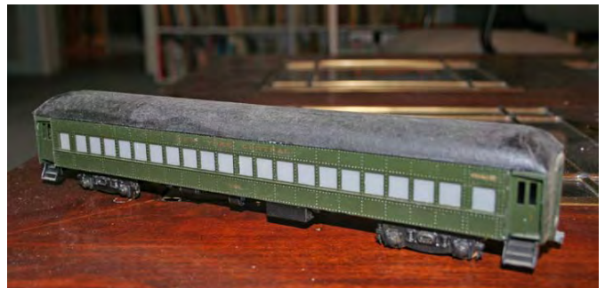
Photo 7 - Scale Craft coach

Other cars were more typical of the construction of the O scale freight car. Wood or stamped metal sides with wood frames. But they produced a wide variety of cars and road names.