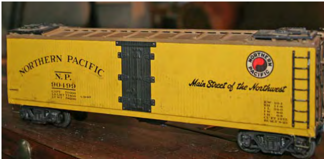
Photo 1 - the Refer

At our local train club meet last month, a friend brought me an "old" train car. He is in HO and had no use for it, so thought I might be interested. Well, I never turn down anything "free". When he gave it to me it was obviously an old O scale refrigerator car. But turning it over to see if I could find a clue as to the manufacturer, I saw it was made by Scale Craft. Now, I am excited. Although I know of Scale Craft's history in OO gauge, I had never had one of their O scale cars. So, why is this exciting to me? And why might it be of interest to folks in the tinplate side of the hobby?