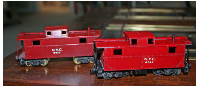
Photo 2 - Scale Craft and Lionel cabooses, Lionel on the right

lettered. There are even stories that Lionel copied Scale Craft's dies for its four freight cars. However, if copied, the Lionel version did have some differences, see the undersides of the two cabooses, for example.