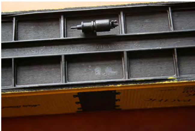
Photo 5 - Reefer underbody showing the Scale Craft name in the frame

But, back to Scale Craft. In addition to their "Lionel" four cars, they offered a full line of kits in OO scale. My favorite is a baggage car and coach. These are of die cast metal and are of equal in quality to the cast freight cars - and in my opinion of a quality equal to anything produced in the next 50 years. The doors open and the stairwell traps even fold back to let OO scale passengers climb into the car! (Photo 7)