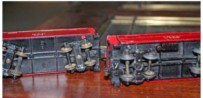
Photo 3 - Undersides of Scale Craft and Lionel cabooses, Lionel on the right

So, now back to Scale Craft. This Chicago firm had been making O scale models throughout the 1930's. I have two of their O scale catalogs, one from 1934 and one 1937. So looking for my new refer, there it was in both catalogs. So, I was able to verify its authenticity. (Photo 4)