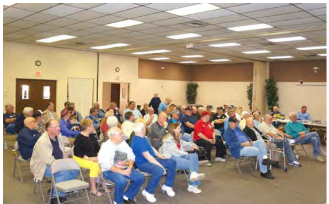
Wow! A full house for the first meeting of the year.