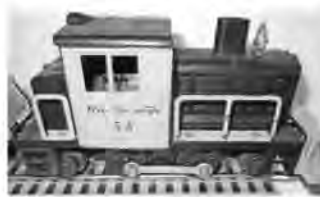
#53 with "correct A"

Admission $5 - includes complete catalog