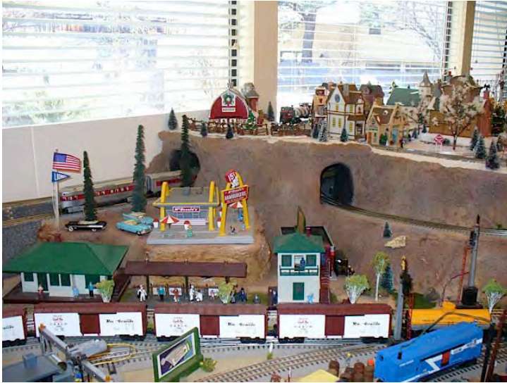
More from Frank Dean's layout tour following the Rio Grande Chapter Meet