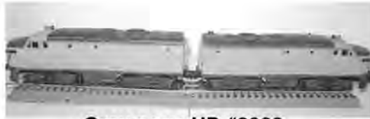
Grey nose UP #2023