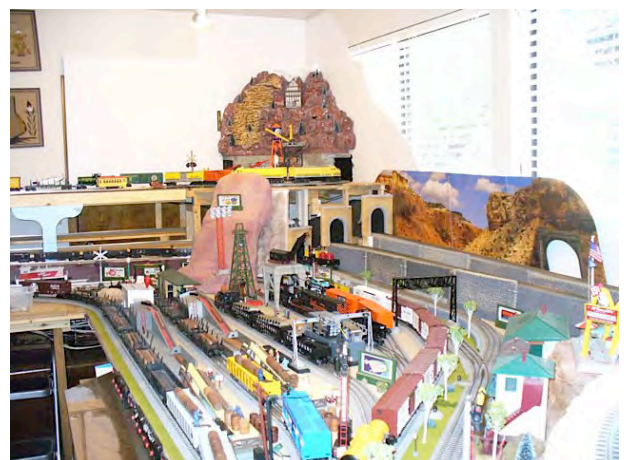
After Meet visitation to see Frank Dean's layout utilizing Fastrack and numerous postwar accessories