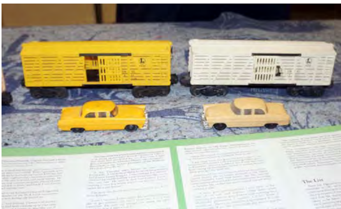
Some of the chemically altered cars from Gordon's collection. Originals on the left, "rare" variations on the right (thanks to modern chemistry)