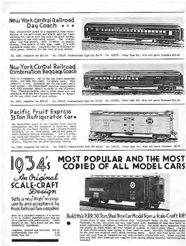
Photo 4 - Scale Craft catalog page showing my Refrigerator Car