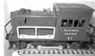
#42 Picatinny Arsenal