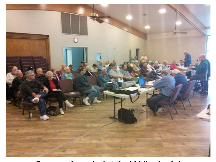
Everyone is ready, Let the bidding begin!