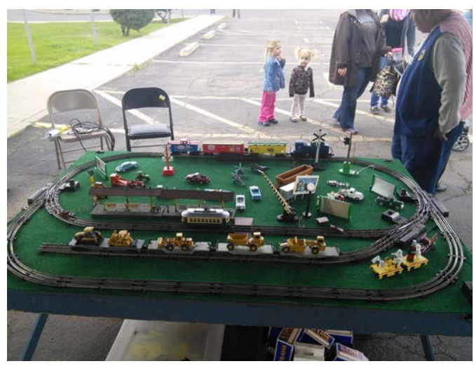
The little layout that could, lots of action, even a trolley!