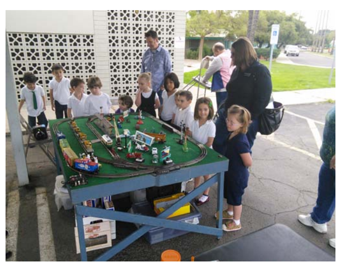
The children had many choices but the trains had their attention, if it was even for a brief moment.