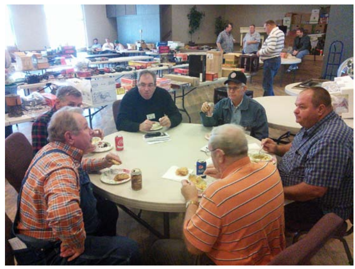
The lunchtime break was delicious homemade soup along with corn bread muffins