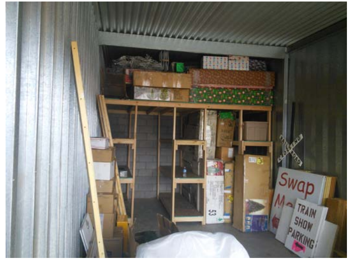
The once a year ATTS items are now stored out of the way and shelf space is now available for Division inventory