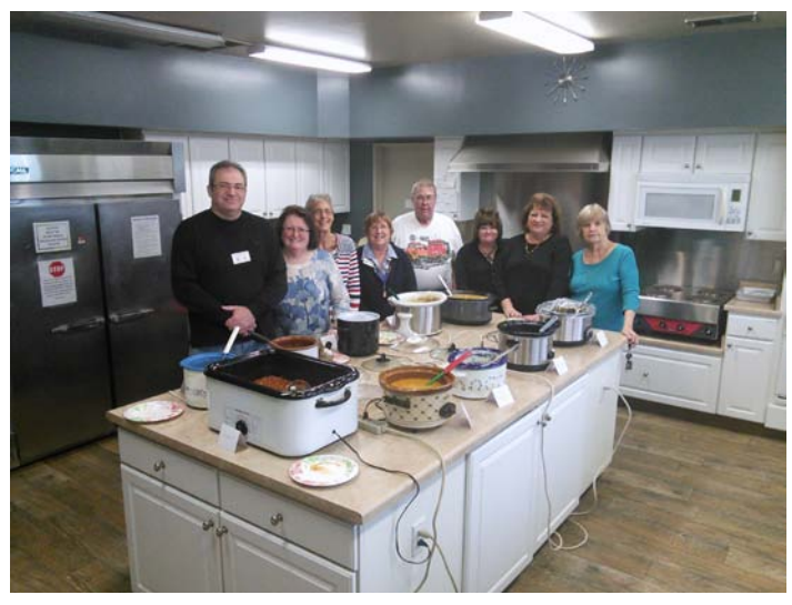
The Chef's behind Souper Bowl I, without their help it couldn't have been done. THANK YOU!