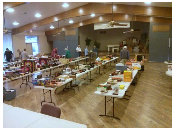
Volunteers setting up the day before the auction

Because of space limitations this page only appeared in the electronic version of the February DISPATCH. What a great idea and one that everyone who attended enjoyed being a part of. Yes, we had that much fun!