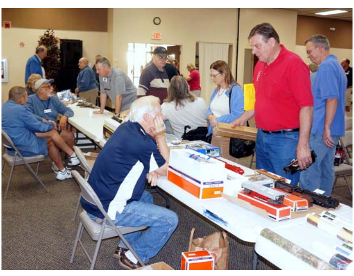
Swapping tales or swapping treasures?