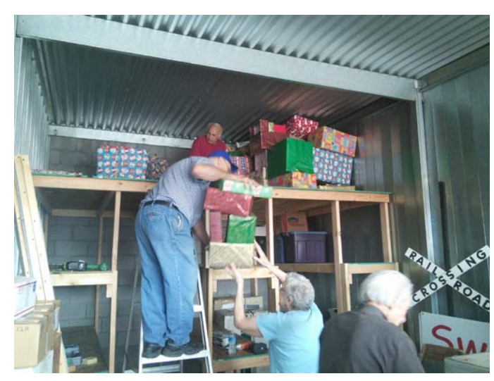
8' legs were attached to the existing shelves along with the framework to support the new floor