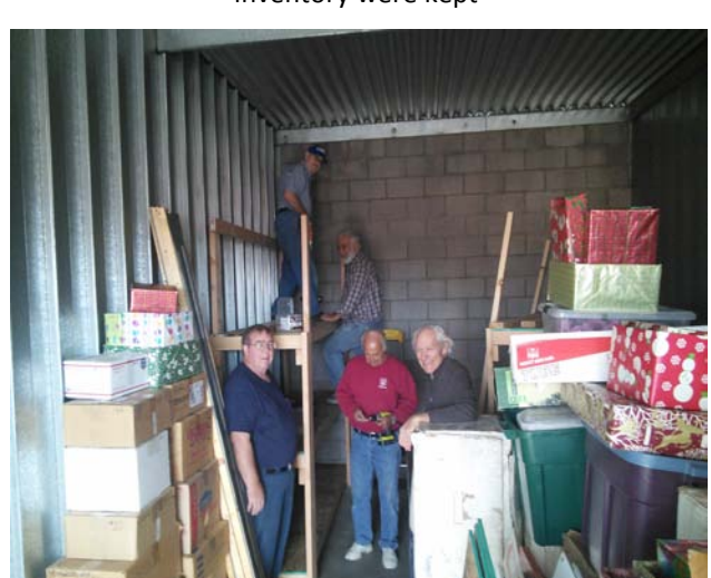
First task move out the ATTS items and move in the shelves from the other unit