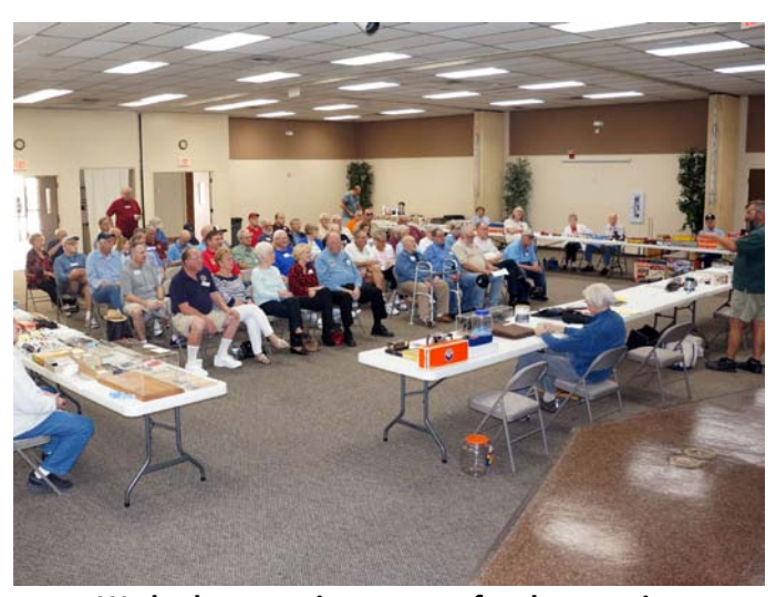
We had a very nice turnout for the meeting