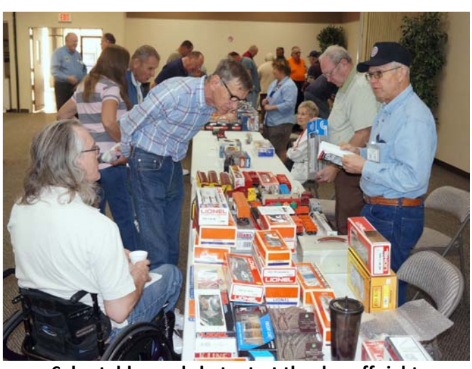
Sales tables and chats start the day off right