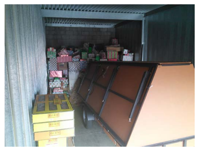
Storage Locker #2 where ATTS items and trailer is parked