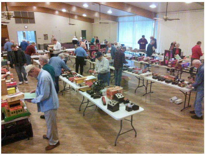
Everyone is looking for a bargain and many found them