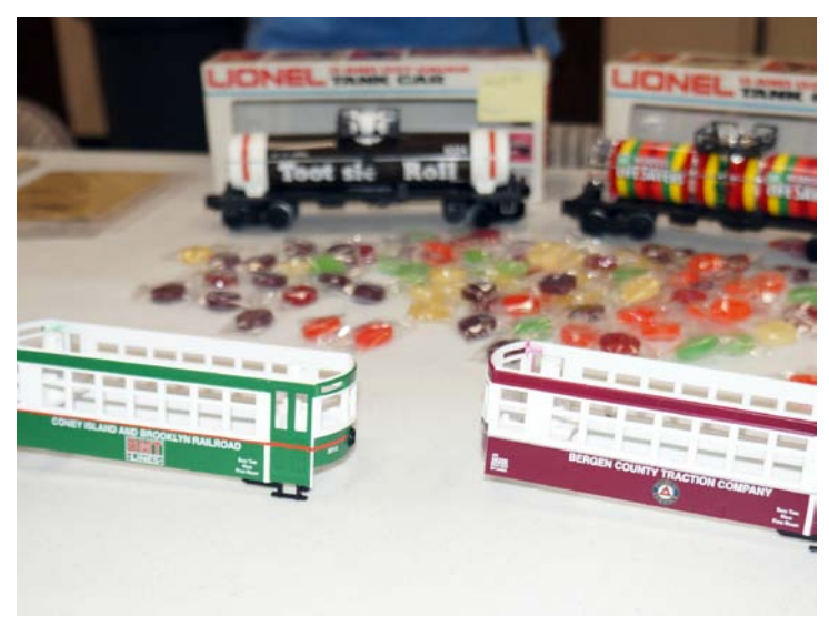
First view of the paint sample trolley's that will be available if you attend the TCA National Convention this year