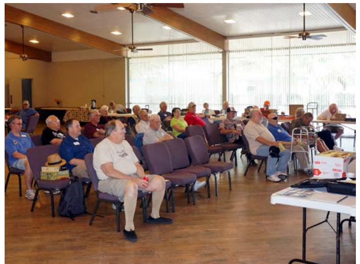
Only a couple of rows of seats and we still had empty chairs