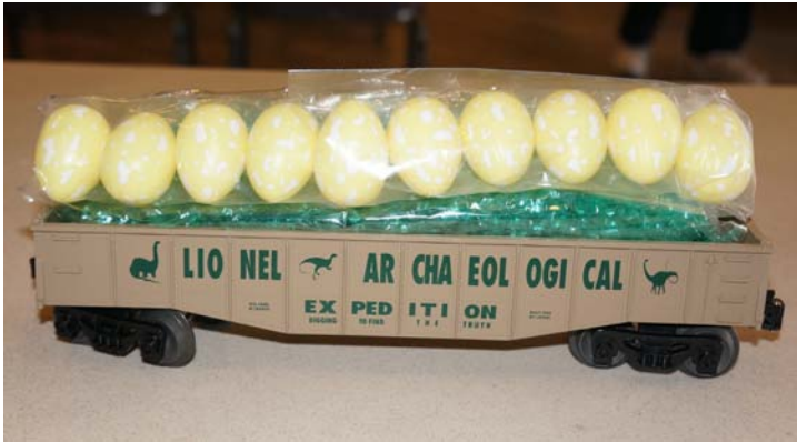
The silliest train car to date goes to Chris Allen for this very prototypical gondola of dinosaur eggs. The play value is trying to keep the load in the gondola.