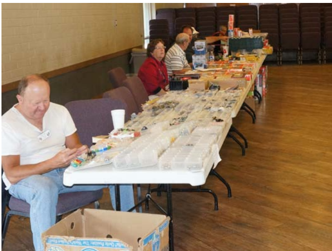
But for the most part April's Meet looked like this