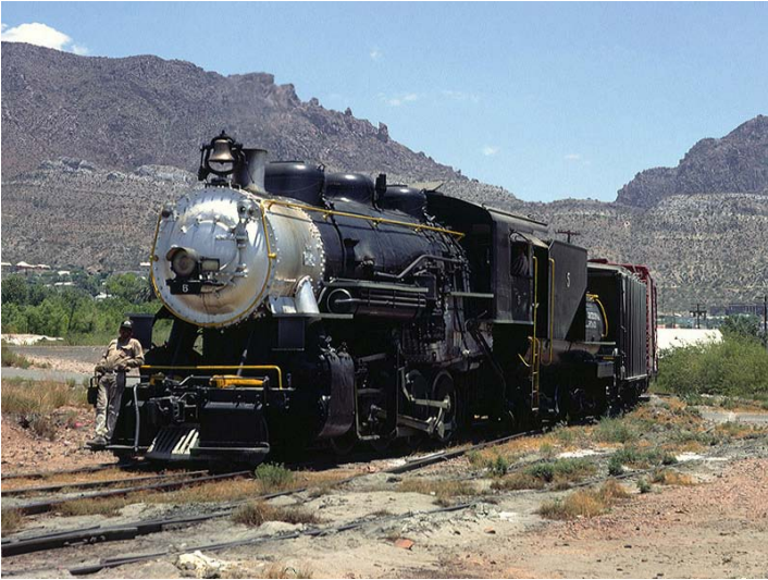
Another view of MAA 5, this time doing yard switching duties in Superior AZ, June 1967. She was retired a few months later

FOR THINGS THAT DIDN'T FIT ELSEWHERE or BREAKING NEWS!