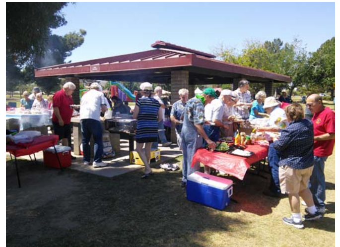
The grill chef's worked their magic for several shifts of club members who were doing volunteer work in the Model Railroad Building