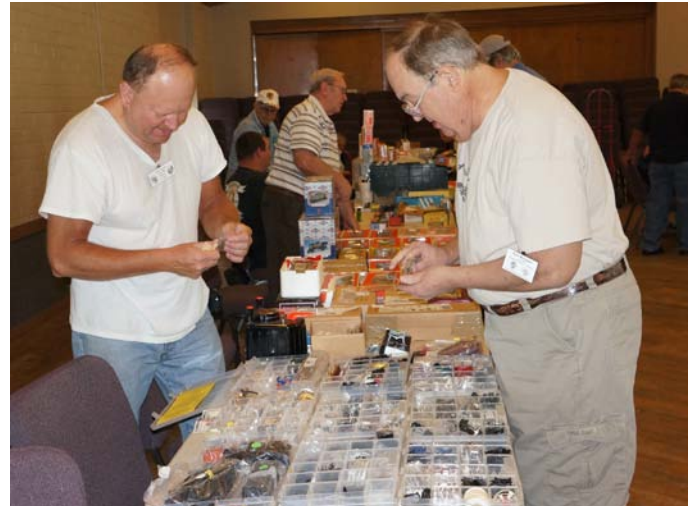
And even a little on the other side as well