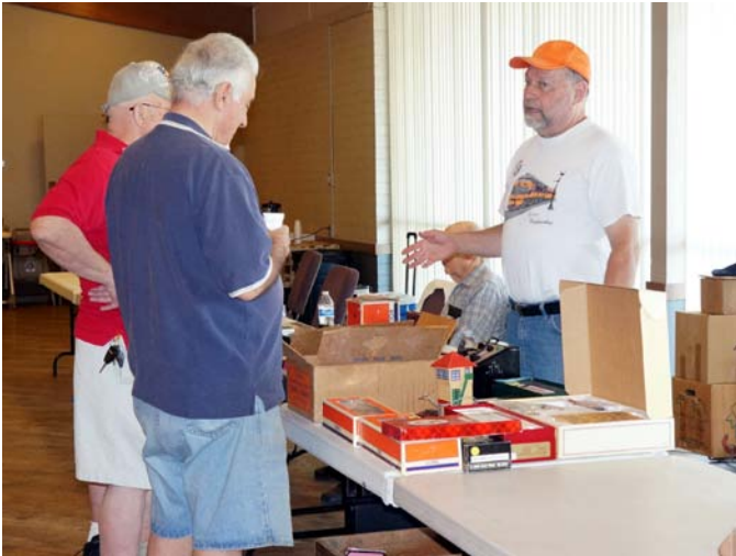
Well there was a little activity on this side of the hall