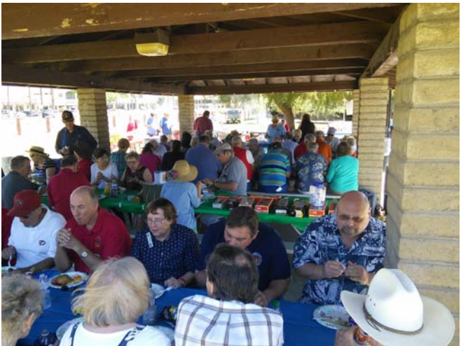
The first wave of happy picnickers enjoying the great weather. The friendships made the event so worthwhile