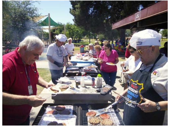
It was hard to keep the crowd away once the first set of burgers, dogs and brats were ready. The food service was well thought out and flowed very well