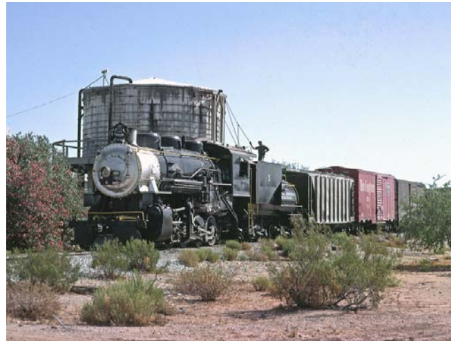
Engine #5 taking on water at Desert Tank, June 1967

In 1996 Broken Hills Proprietors (BHP) purchased the Magma Copper Company properties including the railroad. The operations of the railroad ceased in 1997. Resolution Copper Mining, LLC now owns the railroad and mine properties.