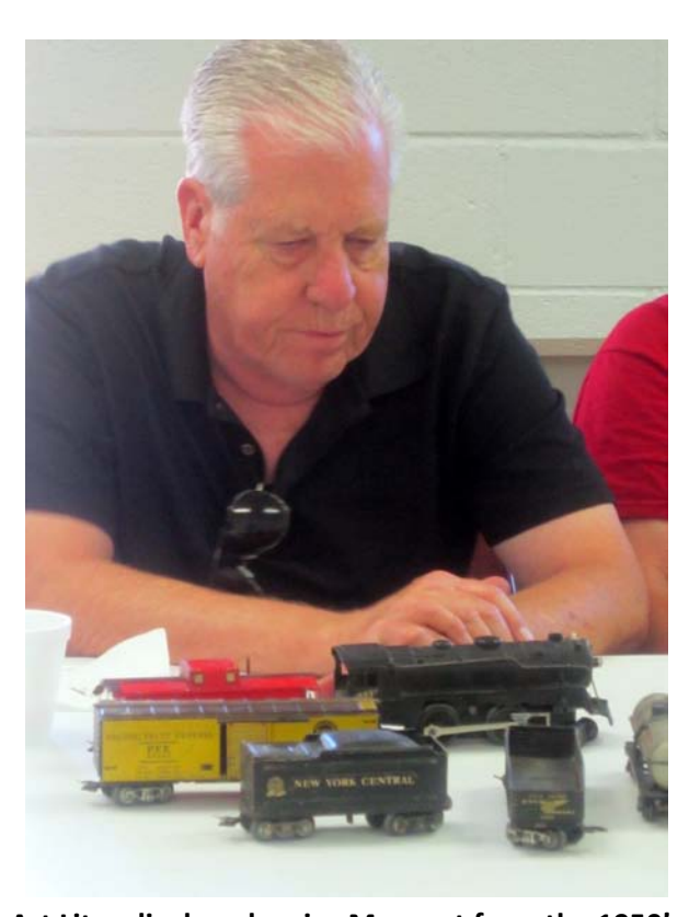
Art Lites displayed a nice Marx set from the 1950's