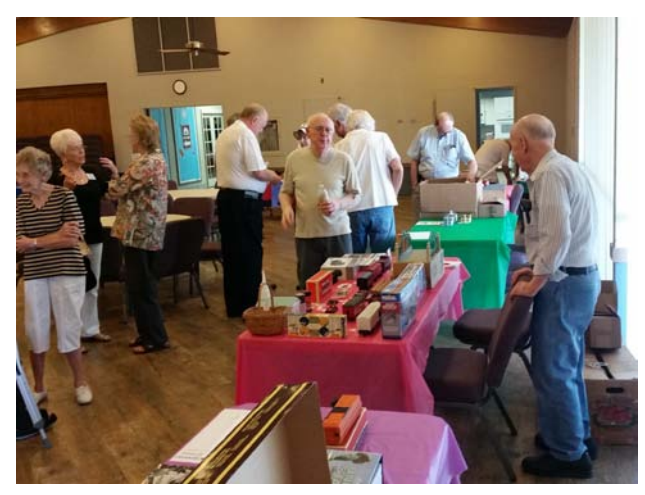
An early crowd just enjoying getting back together after our long summer break