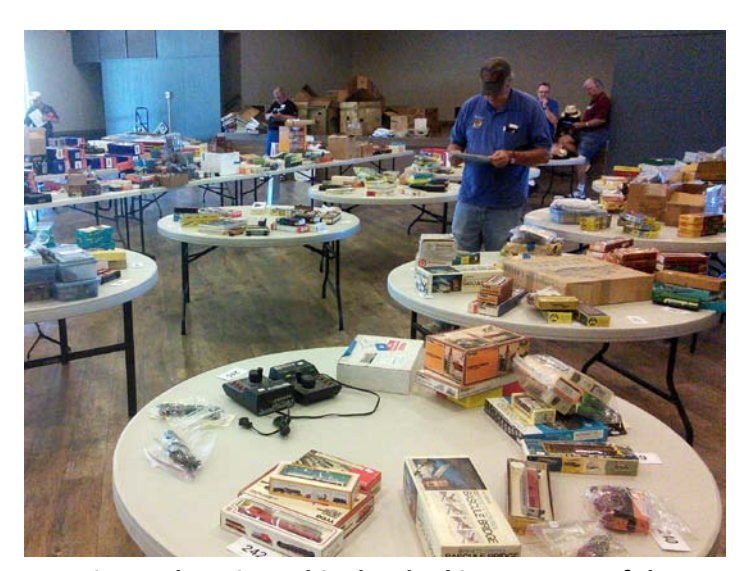
Here is another view, this shot looking at more of the HO side of the auction. It was a busy day for the Auction crew with over 200 lots going under the hammer