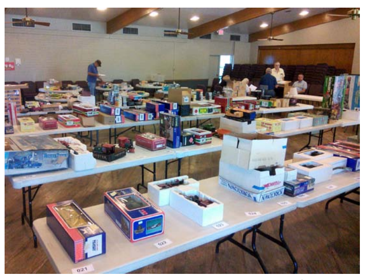
Just part of what the Hall looked like for the HO/G Auction held September 19