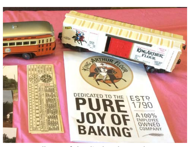
Just a small part of the display that Barbara Turner brought in from her New England vacation