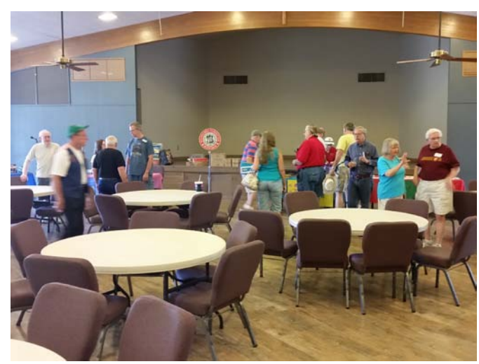
No auditorium style seating, since the church had an event planned after our meeting the hall was already setup