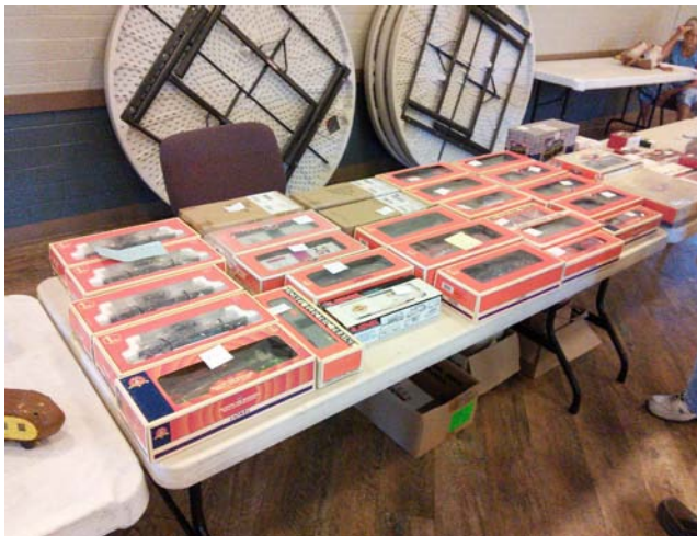
The other side of the hall had a few tables set-up as well, though the sellers were most likely getting a second donut