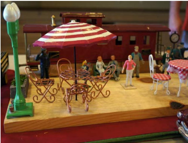
An American Flyer caboose minus trucks served as the starting point for this one