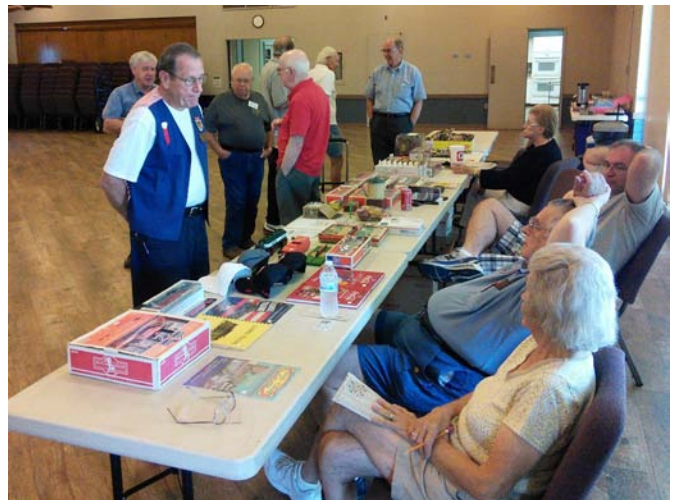
Sales tables were out and the crowd arrived early for the July mni-meet