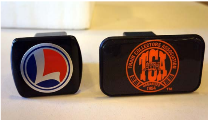
Need a trailer hitch cover? The one on the right is available from the TCA Museum Store and was purchased at the National Convention. The one on the left was made from an eBay purchase of a ZW medallion