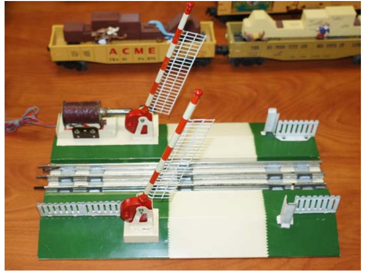
Gordon Wilson's displayed Ken Burling's JEP pre-war track crossing in very good condition