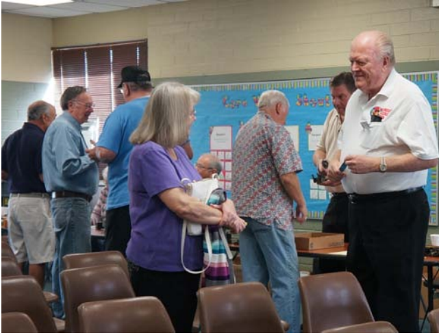
The small space didn't keep anyone from getting updated on how they have been doing recently