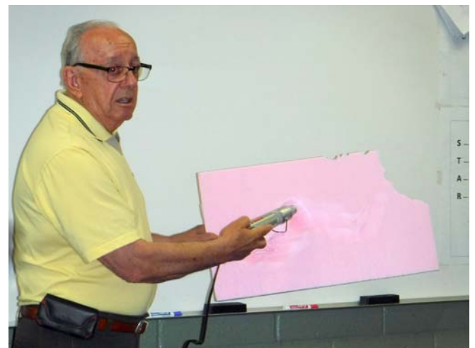
Want a stream or culvert? Use a heat gun available from sources such as Harbor Freight and not the wife’s hair dryer for best results (trust me on that one)