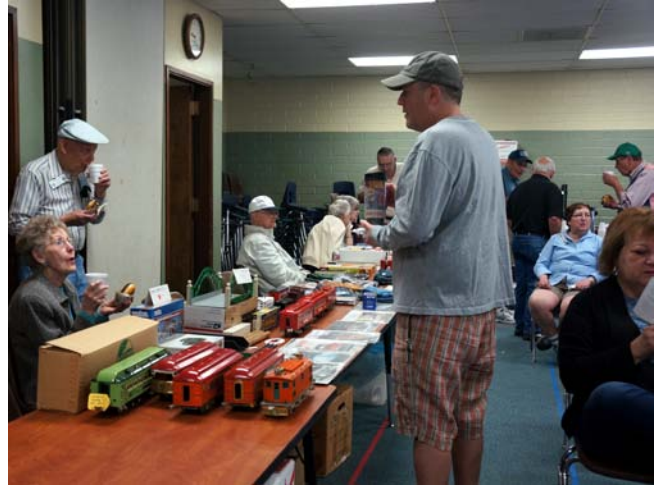
The other side of the room was just as busy with tables sales going in full swing