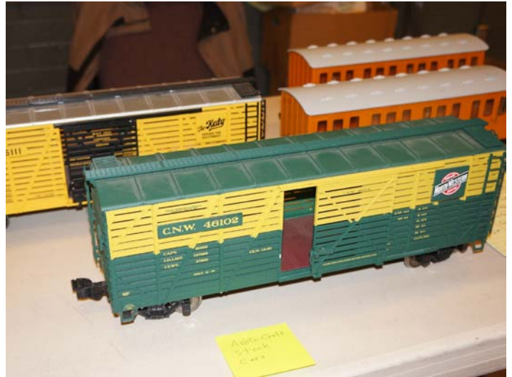
A nice selection of G Gauge items for sale, must be getting ready for the springtime running outdoors.