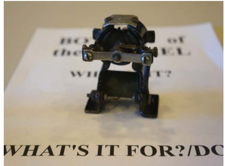
Gordon Wilson's "What is it?" found in a box of trains. For a better picture visit our facebook page