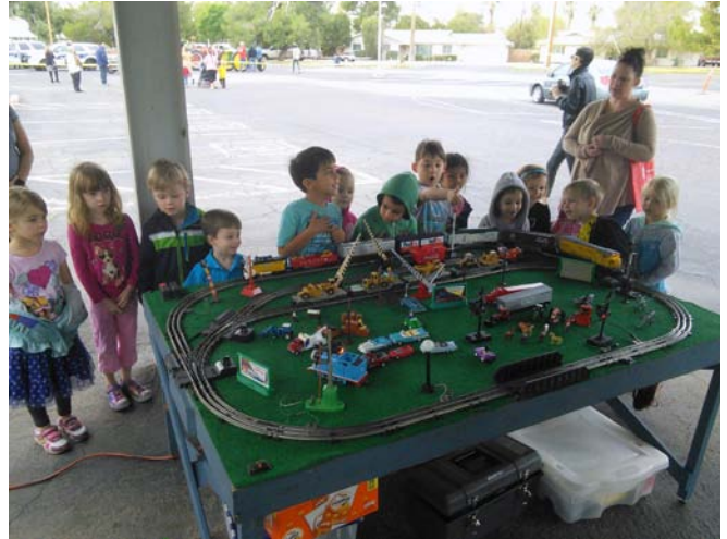
The trains were the first things the children saw and the last stop before they went back into school.