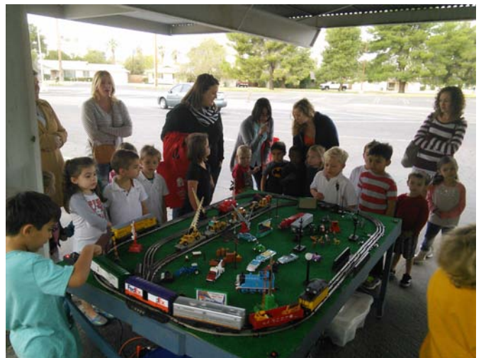
The Kid's Club module has its legs shortened down to make it more easily viewable for the preschoolers