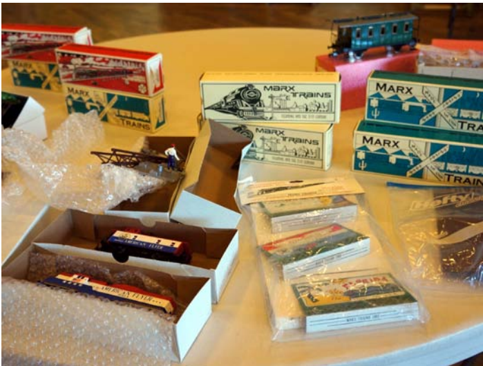
We saw one table full of postwar Marx, here is one full of modern era Marx