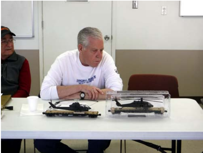
Art Lites had two Menards flat cars with non-prototypical but very fun loads. Securing them is part of fun of these well built inexpensive freight cars.