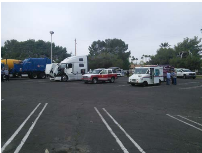
Mail trucks, semi's, ambulances, cement trucks even a city bus and the SWAT Command post showed up!