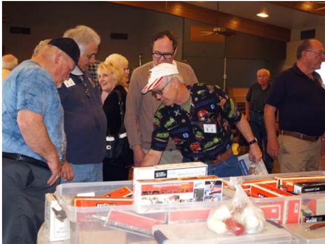
Don't know what's in the box, but it sure is attracting a lot of attention