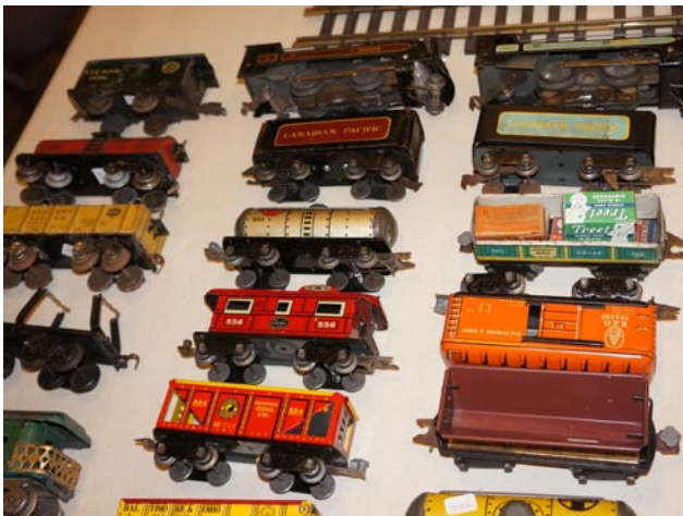
Like Marx 8 wheel? A great selection showed up at the February meet