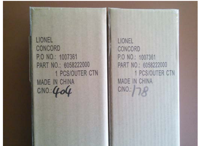
Do you have a low single number? This is # 404 and 178

more. Please check your shipping boxes on the Los Alamos Mint car and if you have a low single digit number please let us know. We have box #6 and would like to add one more.