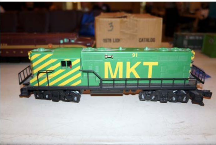
The Educational Segment for March was green. Here is Phil Monahan's JC Penney GP7. Back in the day these were something special to look for and even came with a display case