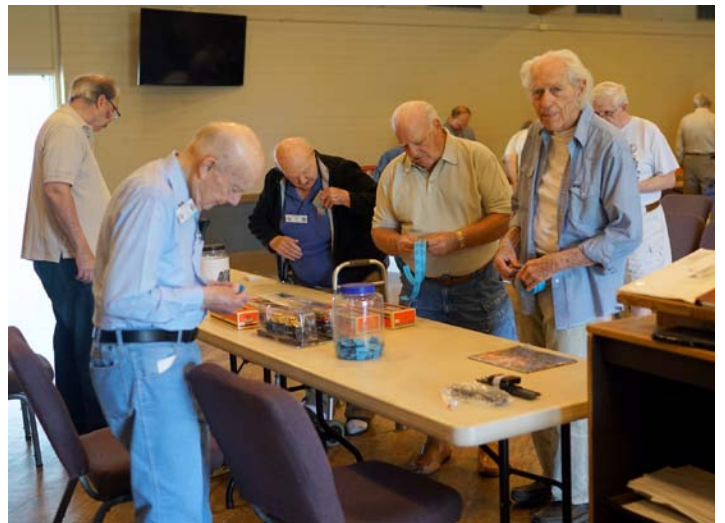
We had a table full of raffle prizes and even more members help out by buying raffle tickets. We thank you for your support!