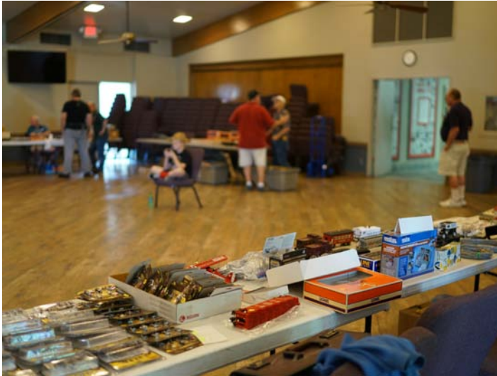
The Hall was so packed with sellers that they even went exploring themselves to what was for sale