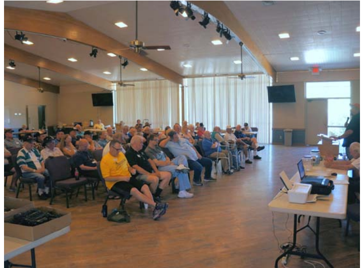
Very full house waiting for the meeting to get over and the pizza buffet to start