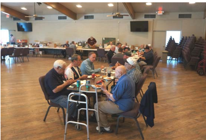
Full tables of members happily munching away on their pizza. If you couldn't find your favorite choice of pie you didn't look hard enough