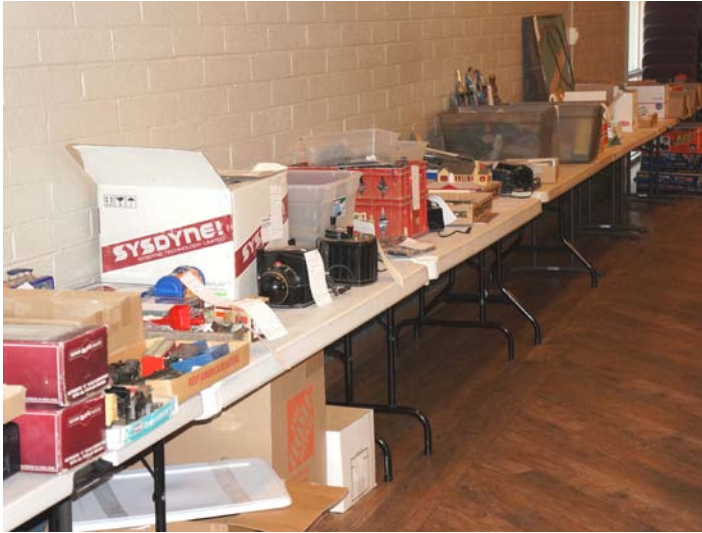
The Pizza Meet member auction lots arrived early and helped get the auction started on time