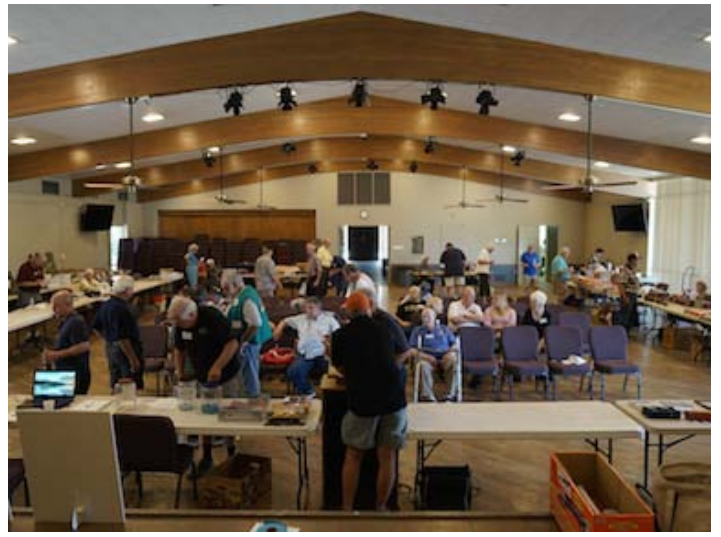
Great view of the hall just before the meeting was called to order. The Pizza Meet is among the most popular meets of the year for Division members.

Get Your Caboose to The 63rd TCA National Convention