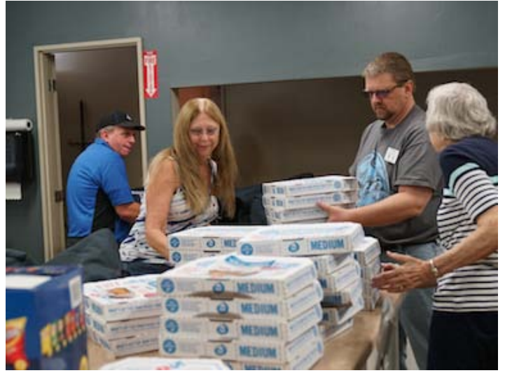
So how many pizzas did we order? Quite a few and adding to our all time total that no club will ever be able to catch.