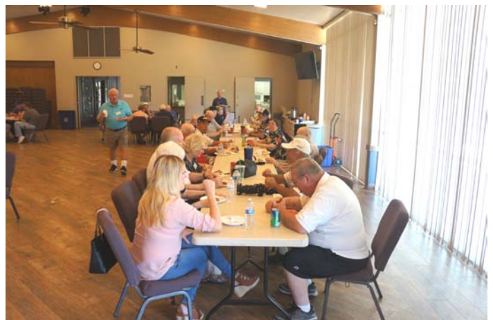
A long table full of Division members enjoying the favorite annual event of the year