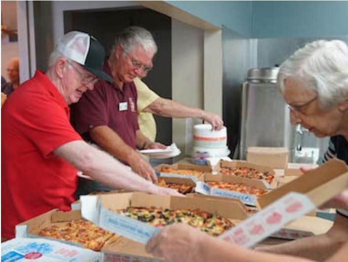
Large selection and helping hands moved the pizza line along quickly

FOR THINGS THAT DIDN'T FIT ELSEWHERE or BREAKING NEWS