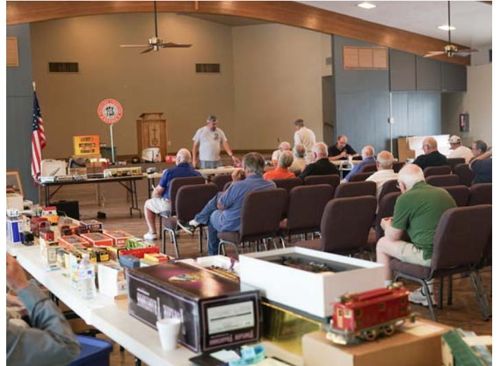
Where did everybody go? Wanna bet we have a full house for the Pizza Meet this month?