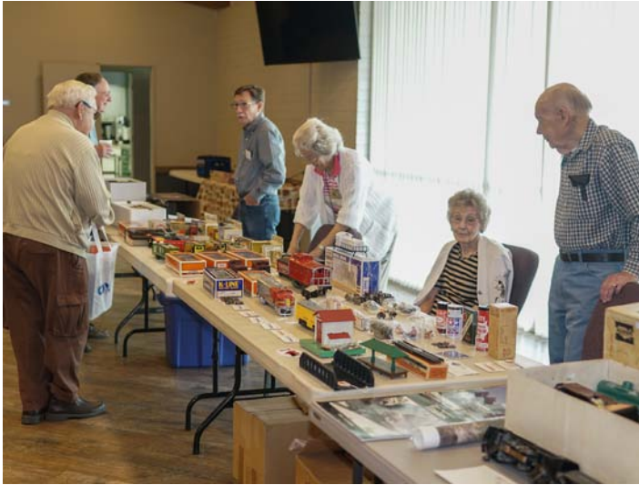
The table sellers came out to the April Meet and quite a few bargains were snapped up early