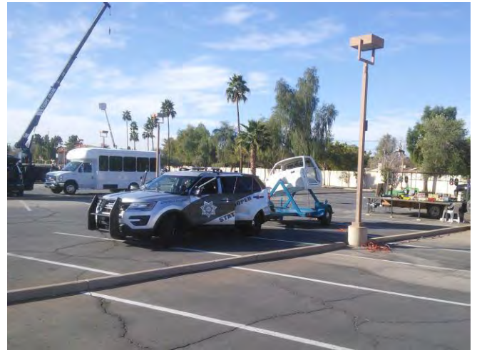
DPS's "Rollover Randy" was right next the Division trailer module in this early morning picture taken during the setup