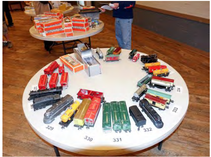
Great table full of variety of trains, all found a new home