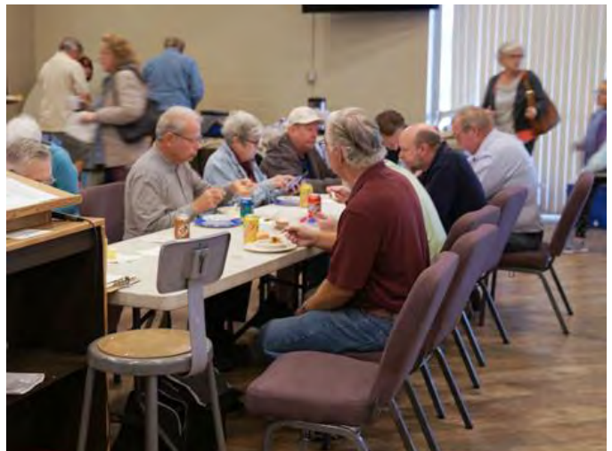
From Auction preview table to lunch table, when the lunch bell rings you can find a place to sit anywhere