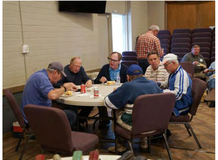
The soup and chili was very tasty and popular