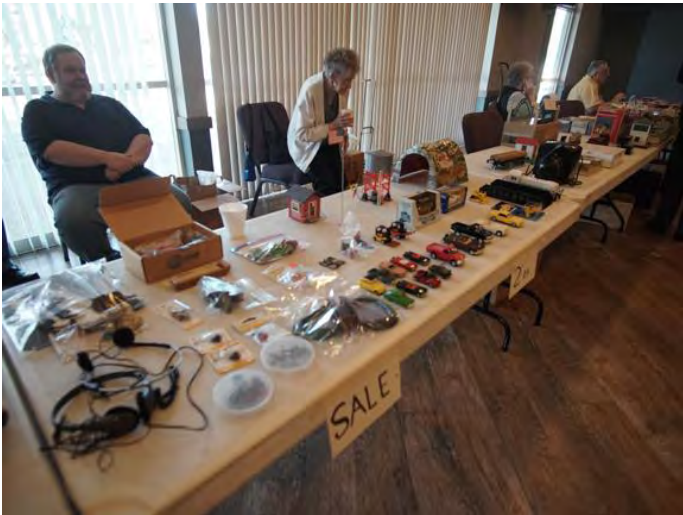
Back at the January Meet the table sellers setup early just waiting for the buyers to arrive