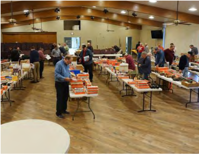
Looking for those bargains during the preview