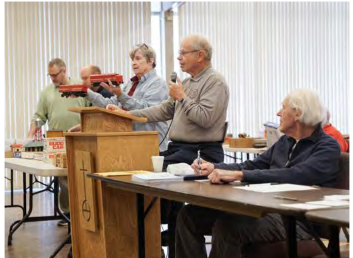
It's too early for me to tell you my story, do you want to be here all day???