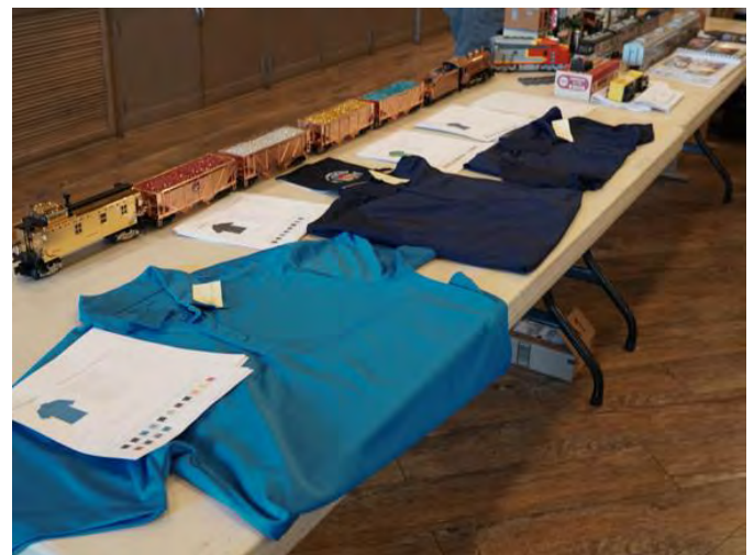
A nice view of Paul Wassermann's colorful copper hopper train and the new Division shirts he is taking orders for. Order yours at the next meet!