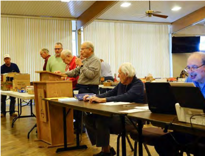
The front line all ready for the bidding to start