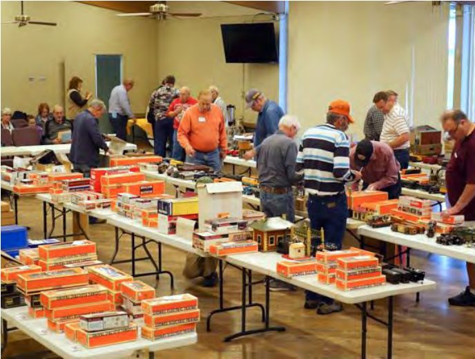
Auction preview has started

FOR THINGS THAT DIDN'T FIT ELSEWHERE or BREAKING NEWS