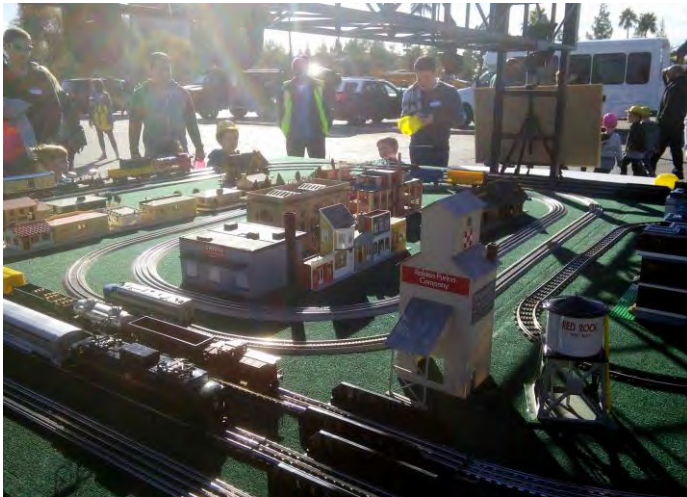
Hard to see all the smiling faces through the early morning glare. Also it's hard to tell who had more fun, them or us

On Thursday January 18 we took the Desert Division Trailer module out for an early morning spin and setup at Grace Christian Academy in Tempe for their Transportation Day. A quick setup with no fuss and no real detail on the layout, the emphasis was on running trains for the children.