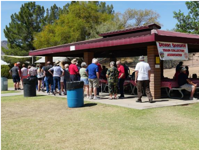
Beautiful weather brought out a large crowd from several of our sister clubs