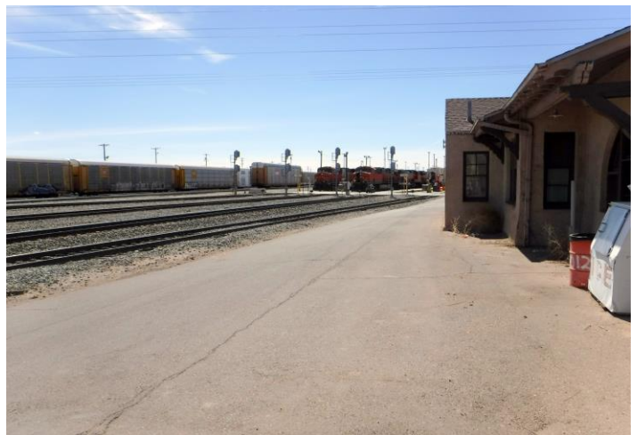
A view of the westbound four mainline crew change and refueling stop just over the back fence from the Harvey House. BNSF currently occupies the old Belen station