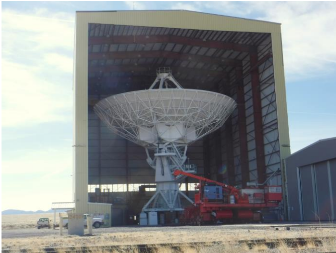
Hard to get an idea of the size, but the antenna in "The Barn" is over 100' tall and 85' wide