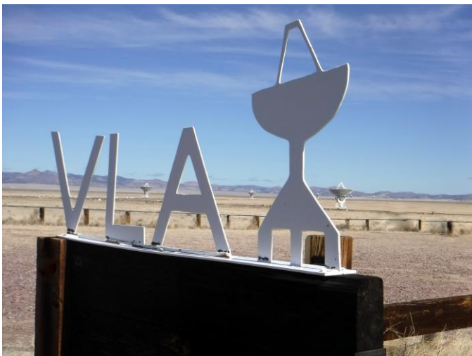
Just outside the main entrance is a small observation view point, what a view.