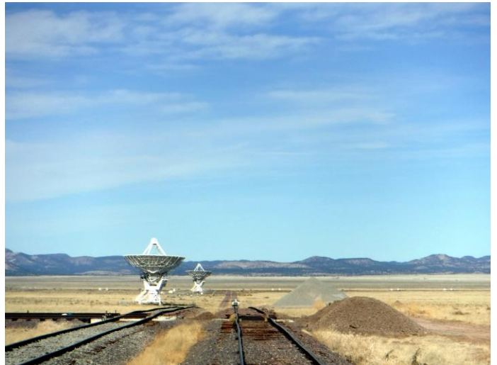
The double tracked system is over 66 miles configured as a "Y". This sectioned is being re-ballast.