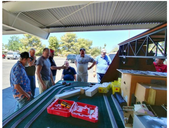
Quite a turnout for the trailer work party. We didn't all just stand around, some of us actually did some work