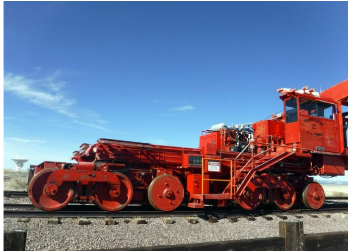
One of the two transporters that work on the double tracked "railroad"