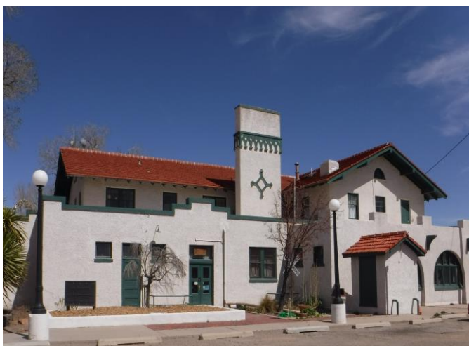
Also as part of the tour is the Harvey House Museum in Belen, New Mexico