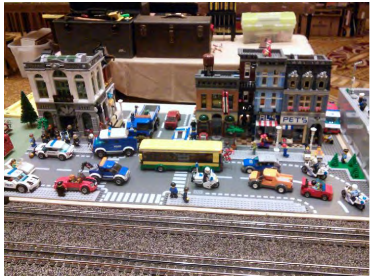
Part of the METCA Kids Club layout featured these LEGO buildings, very nicely done