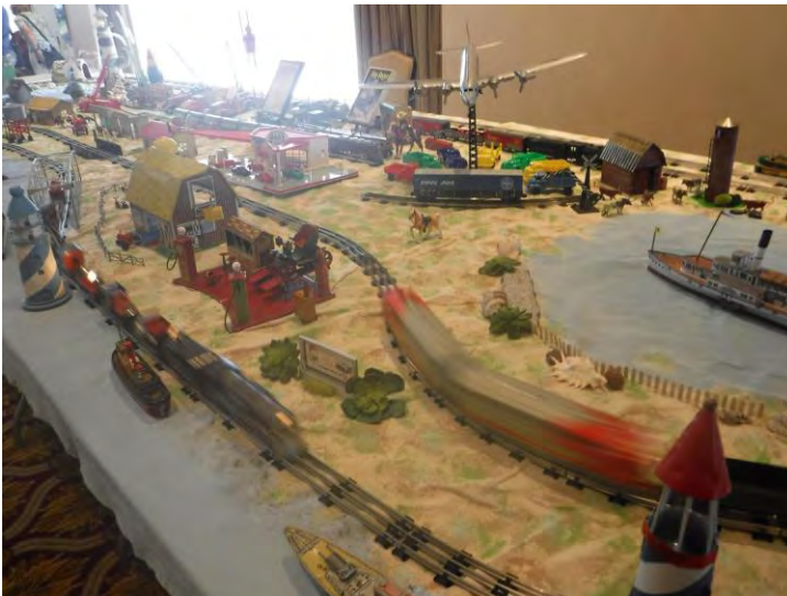
I spent a lot of time looking at this marvelous MARX layout. So many toys and playsets along with trains were featured.