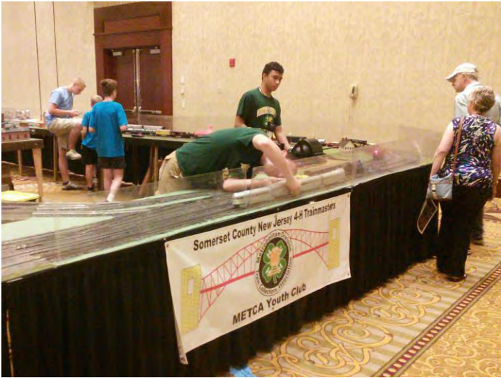
We've featured the Somerset County 4-H Club/METCA Kids Club before. They had a monster Layout at the convention!

A few pictures of the layouts from the 64 th TCA National Convention in Warwick RI