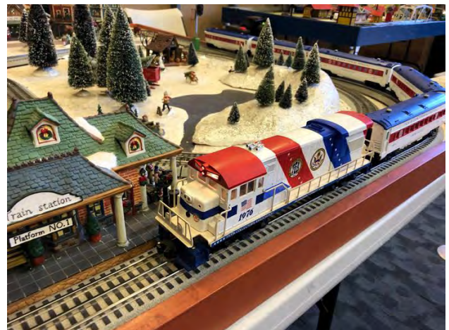
The formerly mint but uniquely one of a kind Atonna 4 th of July "Special" five car passenger set

So, I now, for the past two Fourth of July's have a more appropriate appearing train and even my mall mates agree, it looks better.