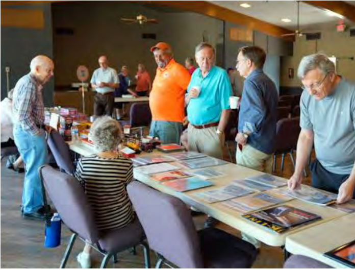
This side of the hall seemed pretty busy, hope the sales followed