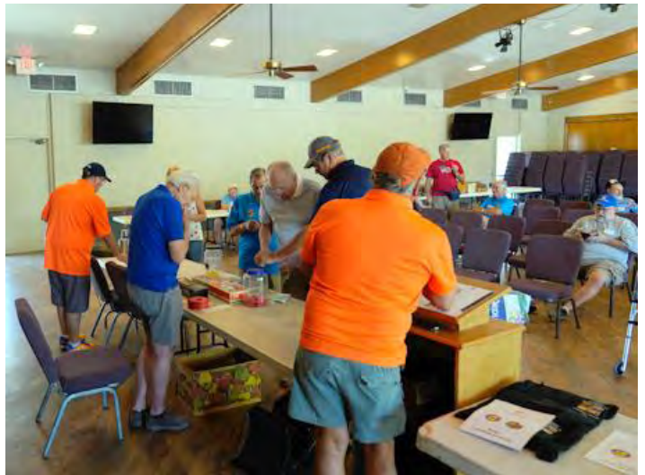
The front table was busy since the light attendance meant a better chance to win!