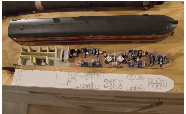
Here is the floor plan and a completed interior of the Great Northern Observation car.