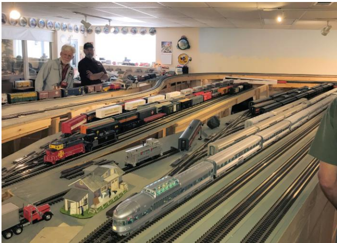
You say you have a long consist that wants to stretch its legs? Ken's layout can easily handle your request!