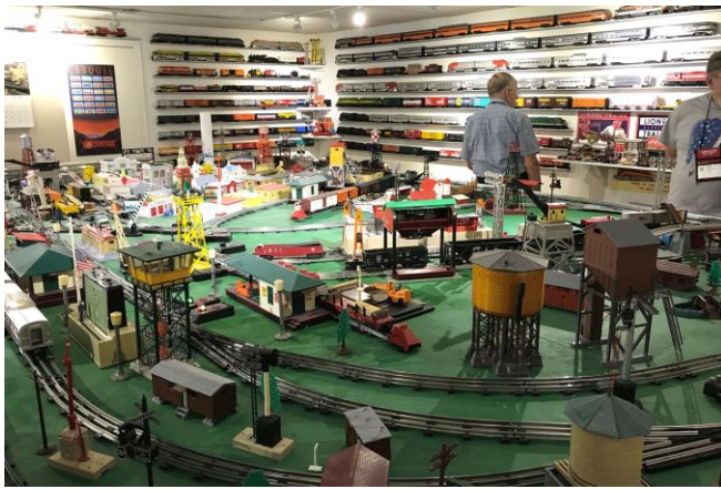
If you visited Ken Miles collection and layout you were probably dumbstruck by the size. This is the smaller postwar side