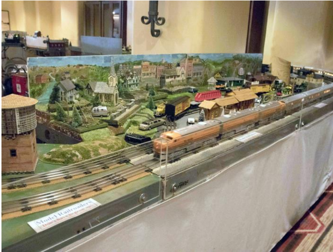
TTOS New Mexico Division had their module up and running