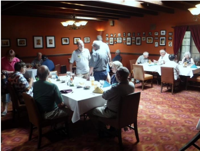
El Pinto's back private backroom filled up quickly