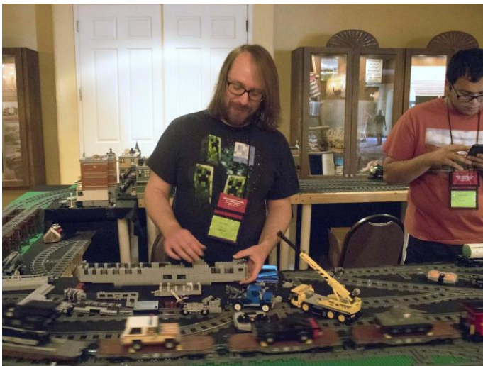
It almost seems to be mandatory to have a LEGO layout at conventions anymore. Here we see a MOC (My Own Creation) of a passenger car getting built