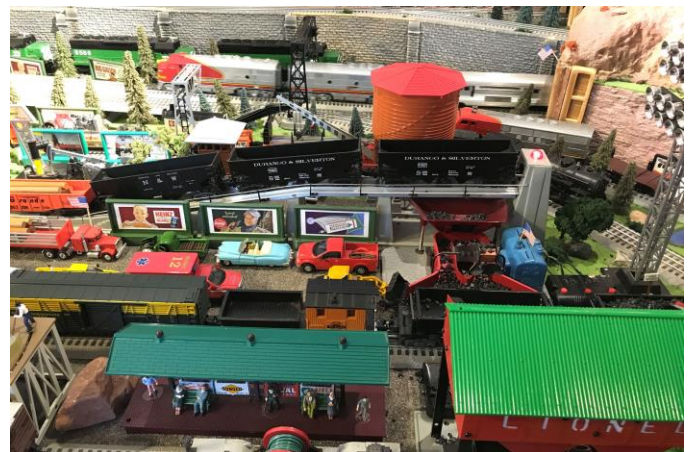
Frank Dean's layout had a wonderful mix of postwar and modern era trains blended in well and a very packed layout