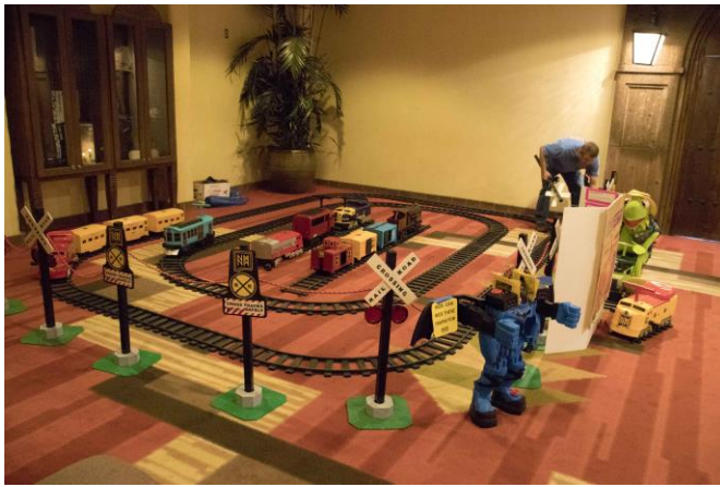
This section of the convention Kids Club area was setup with two "Mighty Casey" riding trains. When the doors opened to the public this area was BUSY!