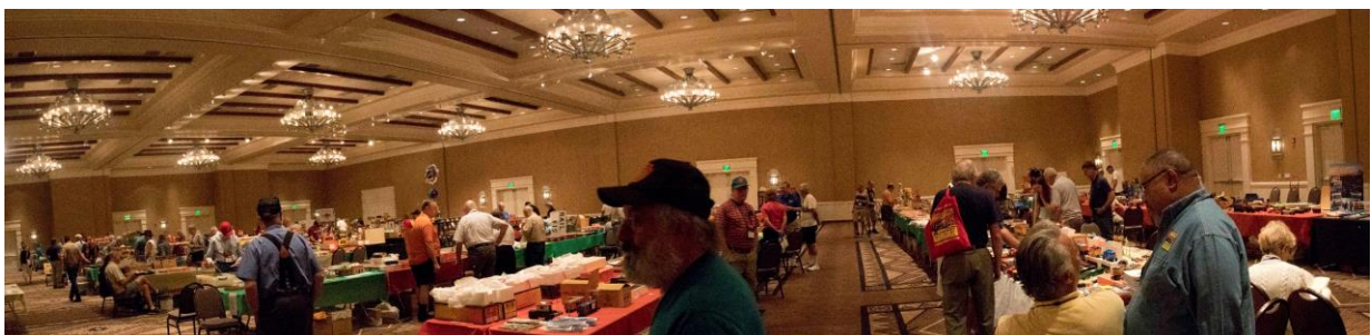
Panoramic view of the trading pits