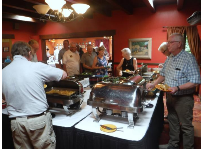
No need to rush there was plenty of great food and desert as well. Some of us were seen going back for seconds...