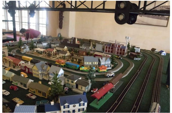
If you look really close you can see Janet Mattern setting up the Coors Light Special on the Division module trailer