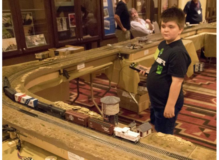
NMRA Kids Club was running trains as this young man was doing running DCS