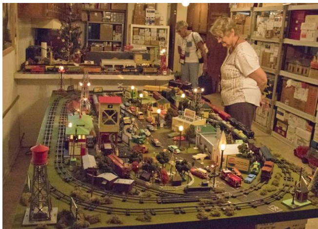
Can you build a layout on a Ping Pong table? Greg Palmer did just that with this all American Flyer layout on display for the layout tours