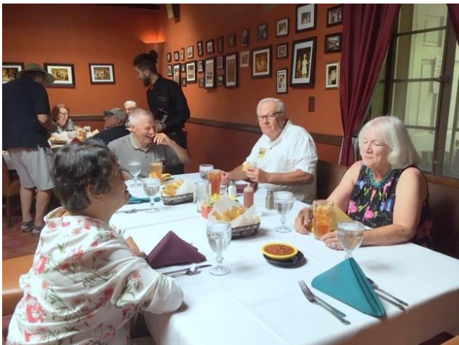
No clue to who these folks are – HELP!