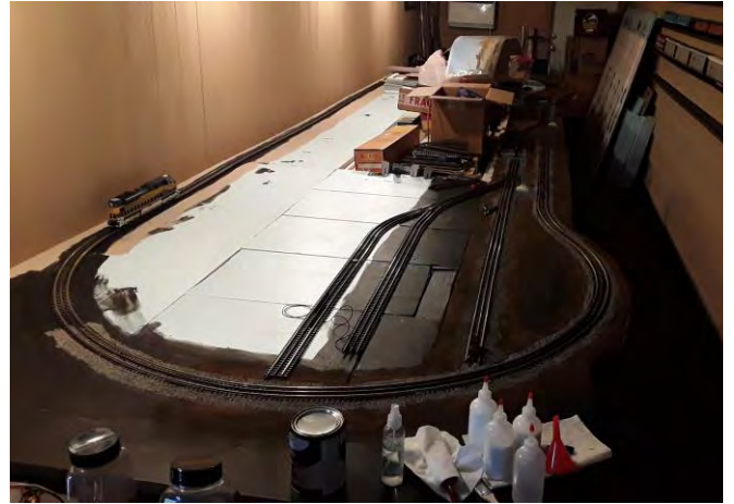
Side windows insulated and drywalled closed, train shelves going up on the right