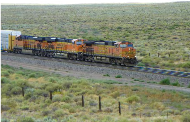
That lead #5045 Dash-9 looks proud to be dragging the GEVO ES44DC heading eastbound