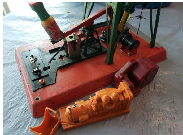
This one is a little worse for wear and needs a few parts to get it up and running again. If you have a spare base please contact me