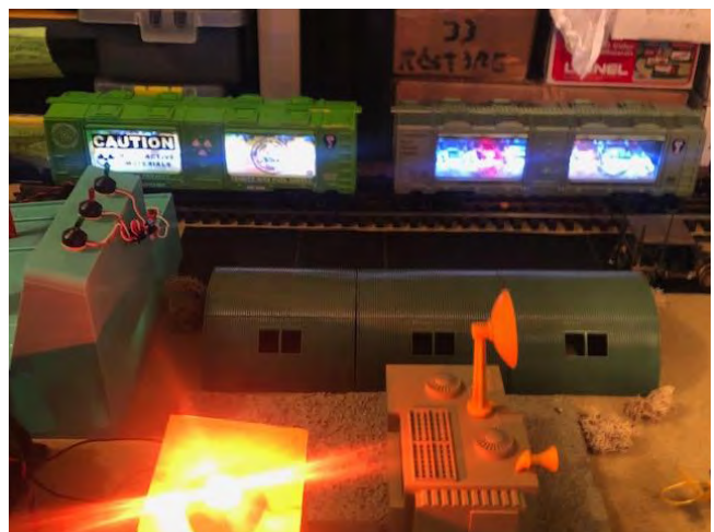
Bits and Pieces from other Lionel accessories rounded out the diorama