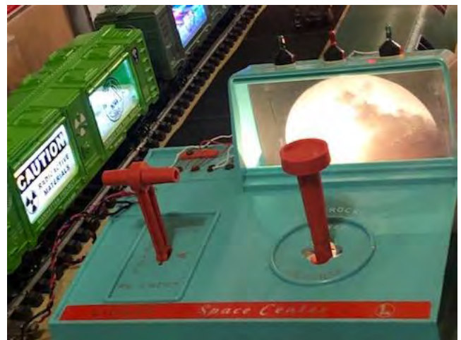
I added a NASA photo of the moon to the Lionel Helios control panel