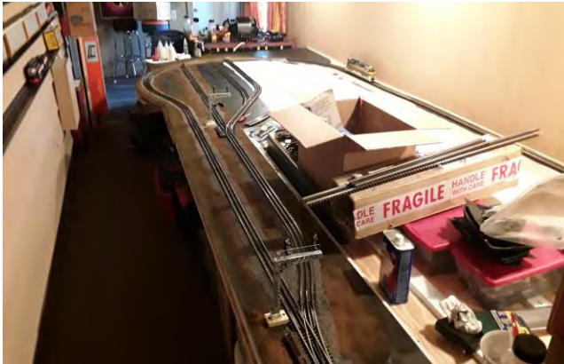
A view from the other end