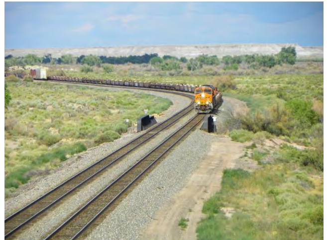
Westbound #6666 heading for a crew change in Winslow, just down the line