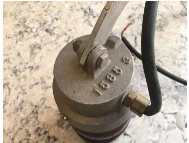
This is a flashing light that used to hang under the old wooden crossing gates, (I had to ask as well)