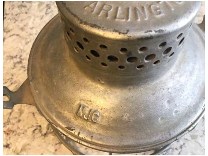
The lantern is clearly stamped for the Jersey Central but the Dressel Railway Lamp Company was headquartered in Arlington, New Jersey. WIN-WIN!