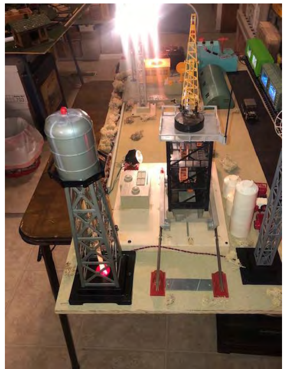
End view of the diorama showing the only non Lionel item, a Marx bubbling water tower