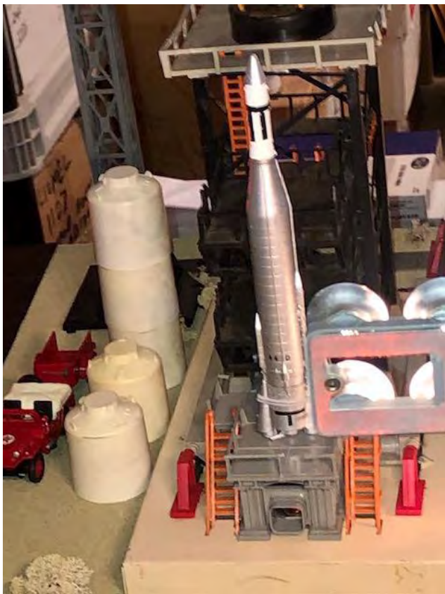
Closeup of the Lionel 175 platform with the model Atlas Missile instead of the Lionel rocket

Moon. Something Lionel could have done with surplus Helios 21 Stock. The mat is a desert mat by Woodland Scenics. I also used our Convention Cars, since my Father and Mother worked at Las Alamos. I used various parts from other Lionel Accessories to make the scene look good. The only non Lionel item used is a Marx bubbling Water Tower. The Atlas Missile is a 1/144 scale Missile which shows you the type of compressed scale Lionel used making the 175 Rocket Launcher. So I hope you enjoy the photos of my Pandemic project.