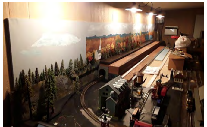
The beginning to some of the landscaping with trees being added. This is the same view as the first picture.