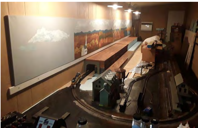
Backdrop getting painted on the wall and sidings are being placed