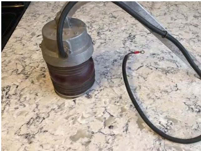
How many of you can identify this piece of railroadiana?