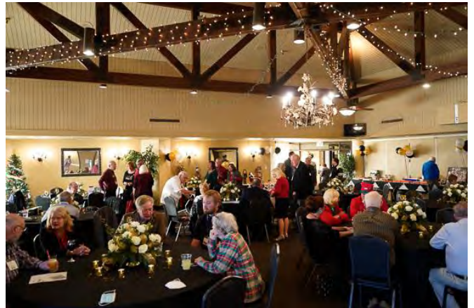
Another view of the interior of the Elks Lodge Banquet Room where the party was held