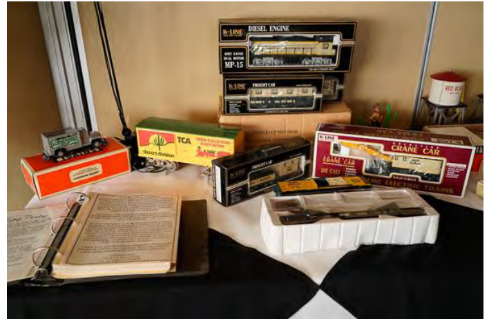
Some of the Division historical items. The 1975 McCoy Boxcar, 25 th Anniversary Step Van and items from the 1997 National Conventoin