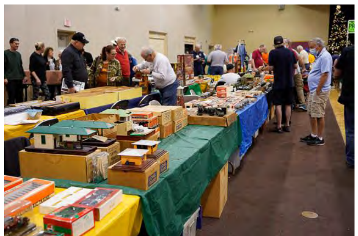
That's more like it. Aisles full of people and sales tables already emptying out.