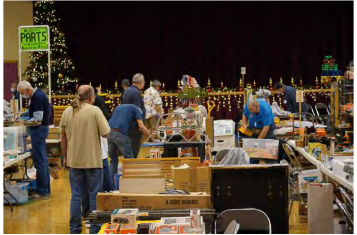
View looking to the front of the Shrine Auditorium before the show opened