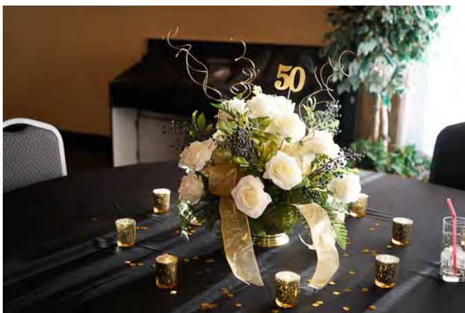
Table decorations for the Anniversary Party. The hall and table decorations were a beautiful blend of our 50 th Anniversary and the Christmas Holiday

York, you never know what you will come home with. That is why thousands come back each year.