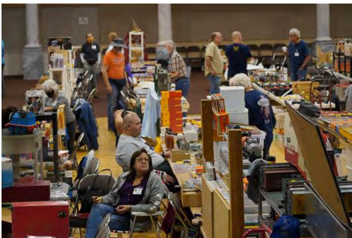
Let's open up! Table sellers ready to go