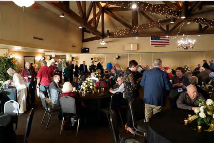
The Phoenix Elks Lodge Banquet Room filled up quickly as members arrived to socialize