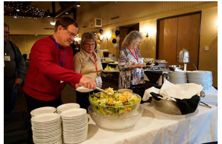
Partial view of the buffet line that always starts out with salad. Wait the best is yet to come...