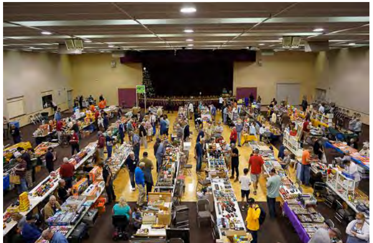
View from on high. The overview of the Shrine Auditorium