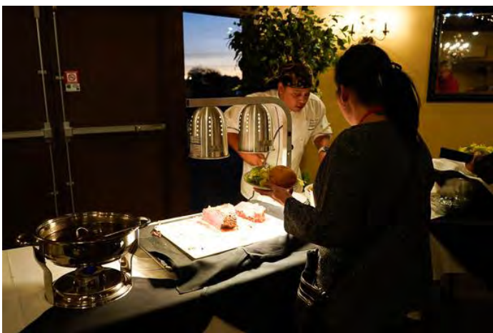
There it is! Prime Rib cooked to perfection and deliciously seasoned along with all the fixin's