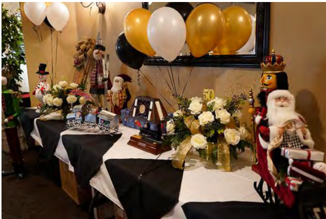
A view of the auction items. Each table had a beautiful floral display instead of the usual table top auction items.