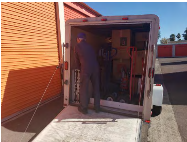
Day before the auction, loading up the trailer