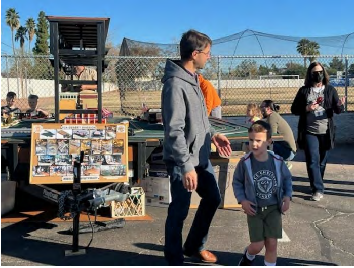
Trailer all setup and ready for the kids