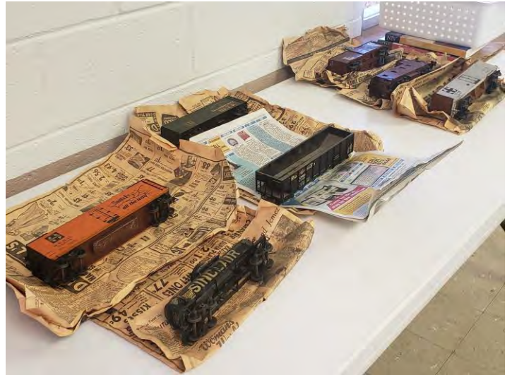
A small sampling of some scale O gauge 2 rail cars that will be offered to Chapter members first at the February meeting prior to being sold to the public