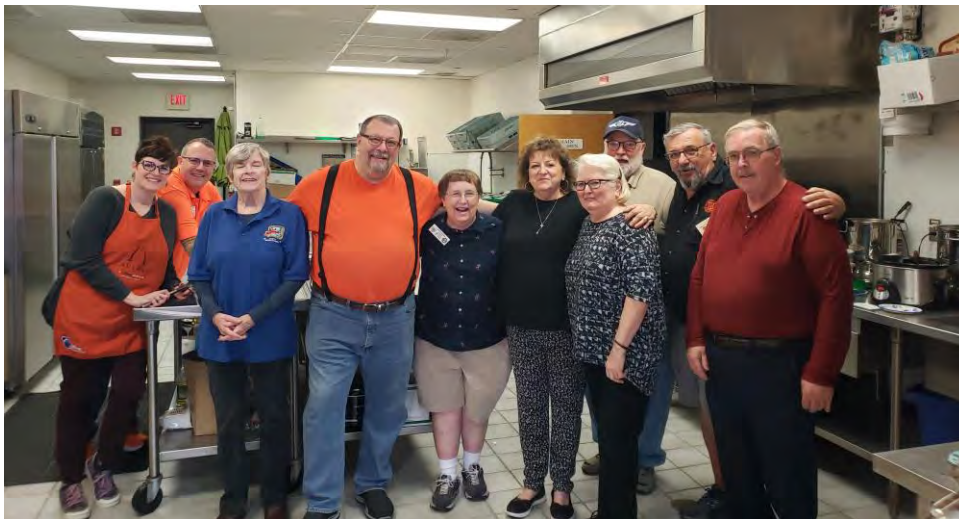
THANK YOU! The kitchen Chef's and Volunteers from Souper Bowl VIII