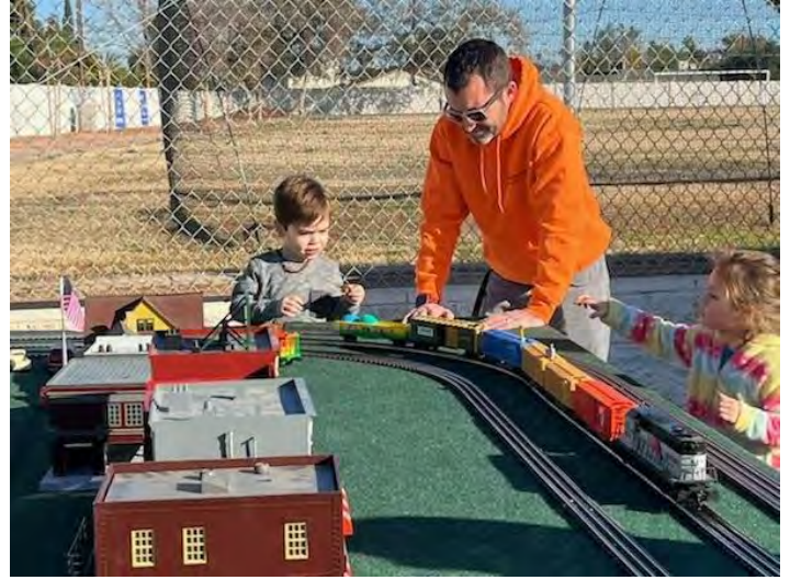
Not too many places beside Desert Division where you can run trains outdoors on a January morning