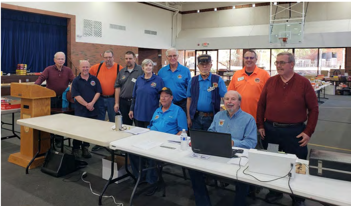
The hard-working Auction Crew of Souper Bowl VIII

As I mentioned earlier, I’ve been fighting some minor health issues, mainly with my eyes and sitting in front of the computer is a bit difficult at present. This will be an abbreviated issue and I hope to be back at 100% next month.