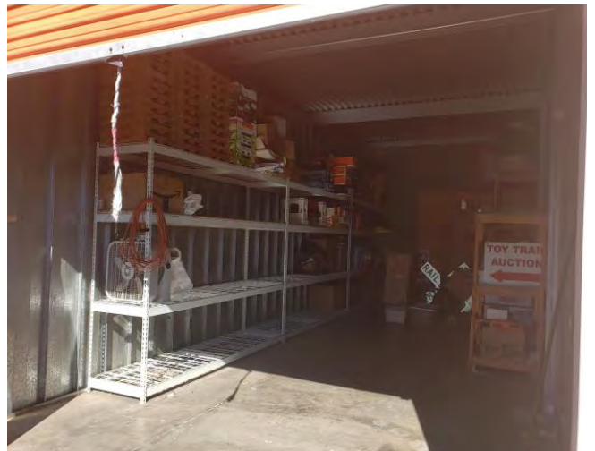
And the cycle continues...