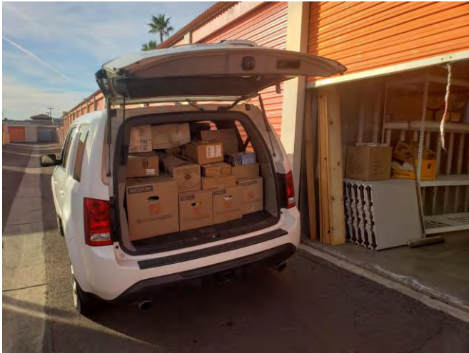
Another consignment being added to the Auction Storage locker

It takes a lot of work to put together an Auction. There's an easy 40 hours' worth of work before and after each of these pictures