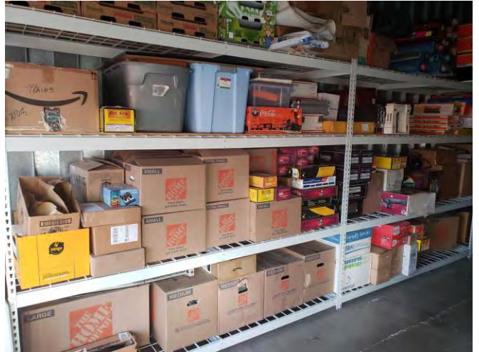
Shelves are full, for now