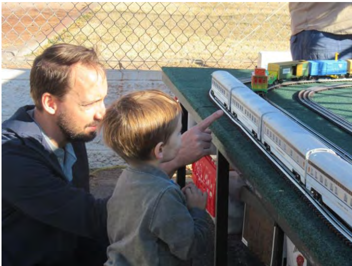
Most of the preschoolers had one or both parents with them