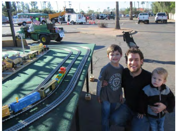
With all the flashing lights, sirens and horns the little trains held their own