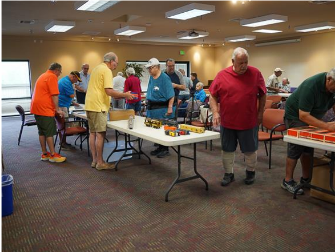
Business was booming at the front table when we opened up shop for the fall train season