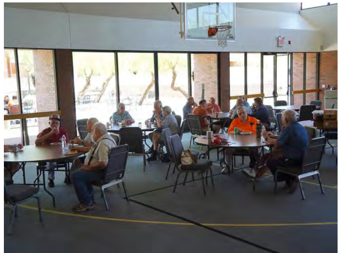
Some of the members enjoying the free Pizza before the afternoon auction