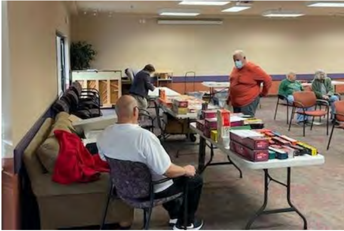
You can tell it's June, Where's the buyers?