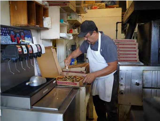
No matter how you slice it, if you missed the Meet, you missed a treat