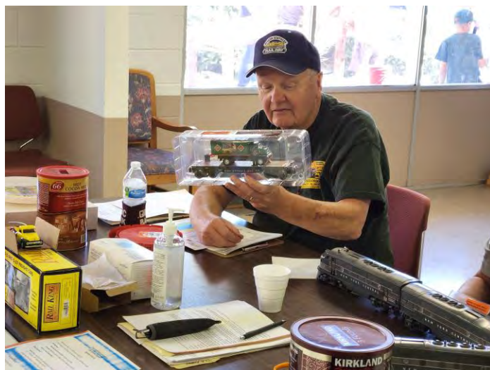
Everett Hagan had several Menards Flat Cars with loads including this one with a Delivery Truck