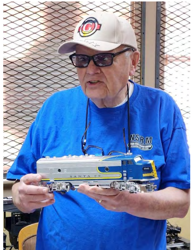
Our run your loco session had several members taking advantage of the 40' length of the Wheels layout. With the purchase of a Cab-1 set, we have modified the layout so that TMCC and Legacy can be operated on any of the tracks. Additionally, Conventional trains