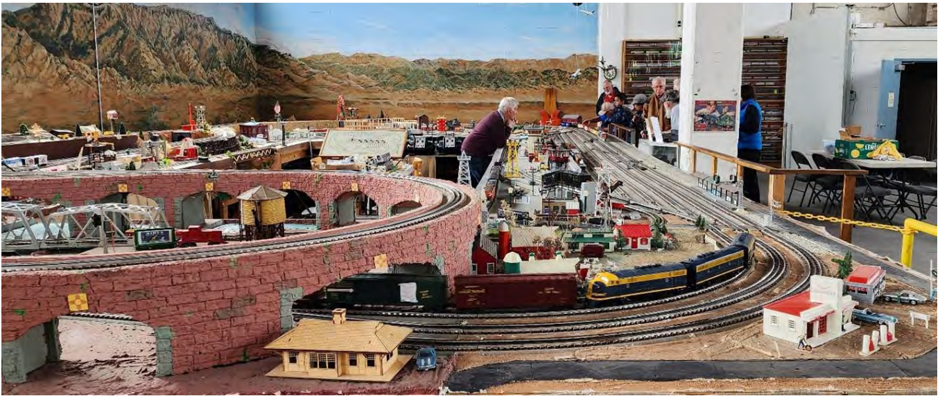
Another photo of the layout at the Albuquerque Wheels Museum located in the old Railyards. Chapter members can bring trains and run them on this layout