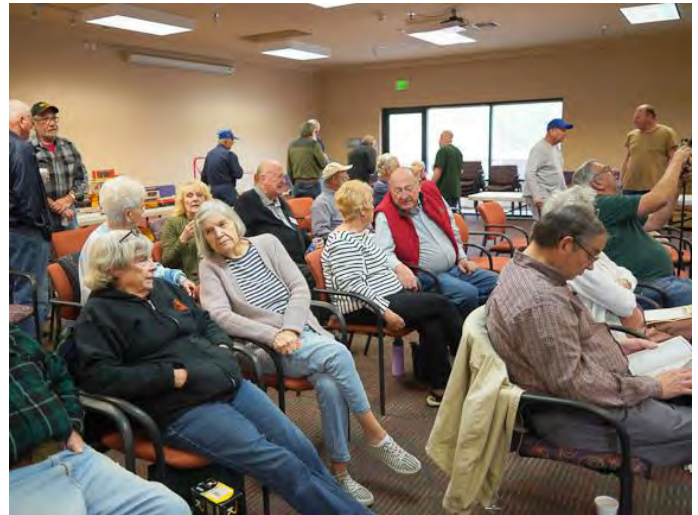
The meeting room was filling up and conversations were numerous