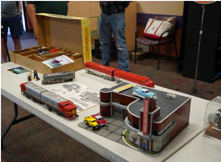
Here's only one of the educational tables. We overflowed onto a second table