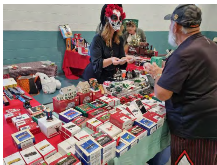
Some of the vendors dressed up for Halloween which was only days away