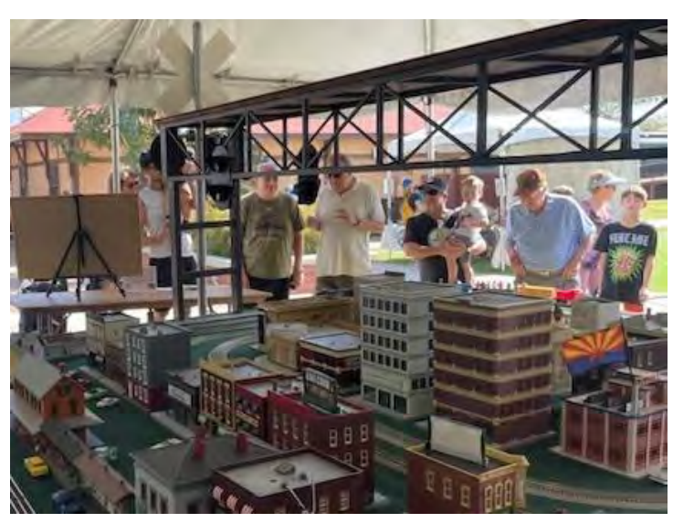
On Sunday the crowd was a bit busier