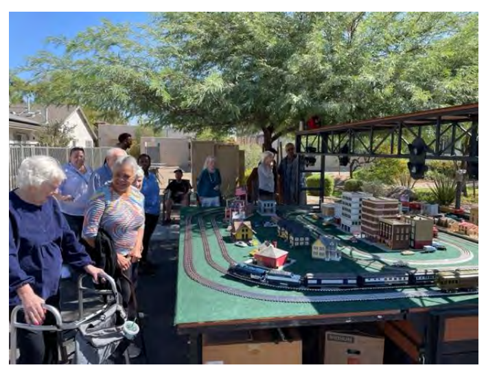
It was a quick set up and only a two hour run, but that's what makes the trailer perfect for the job