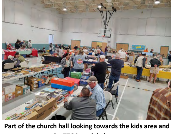
the TTOS module layout