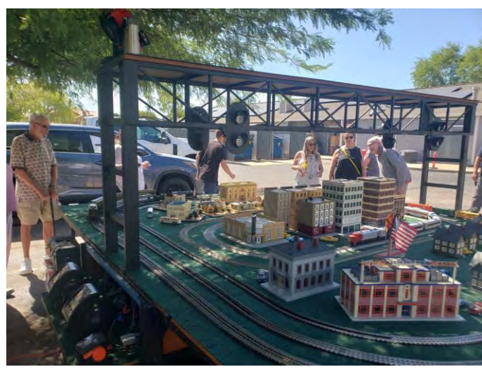
We were there at lunchtime, so the residents came out in small groups