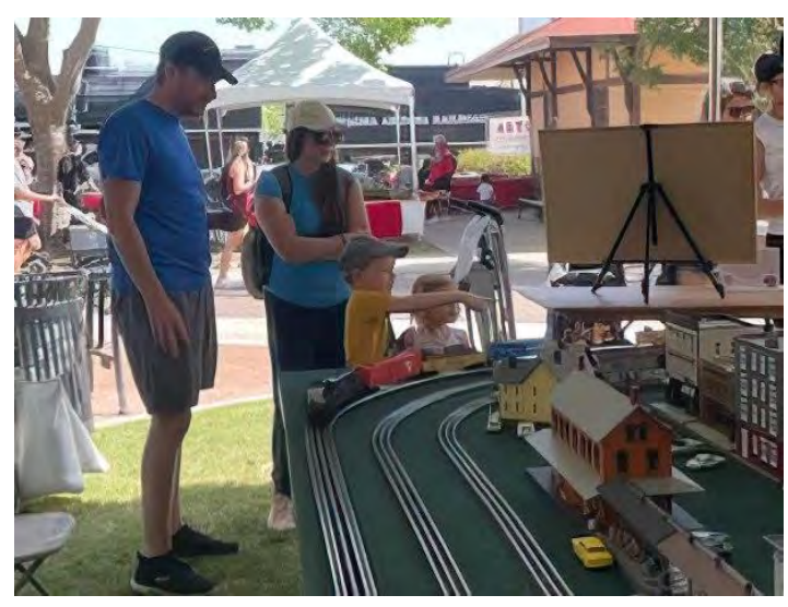
Why we do it. A family enjoying the trains