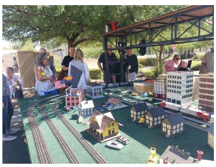
It was a bright and sunny day but we were able to set up near a shady tree in the parking lot