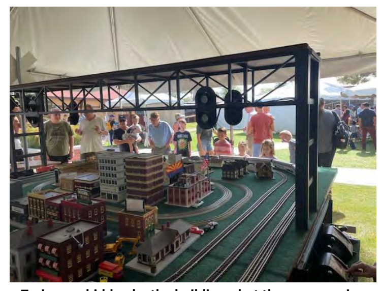
Trains are hidden by the buildings, but they are running