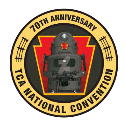
2024 TCA National Convention 70<sup>th</sup> Anniversary Lancaster, Pennsylvania June 16 – June 22, 2024