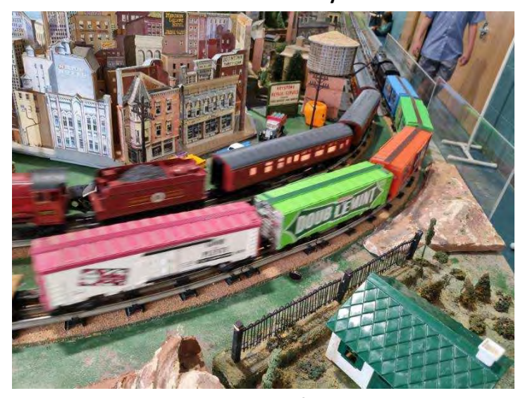
The TTOS layout had many colorful trains running as you can see here