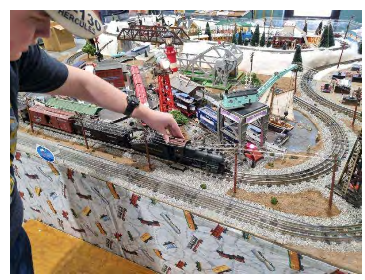
Jon Spargo's 0 gauge layout is always a hit with the public and today was no exception