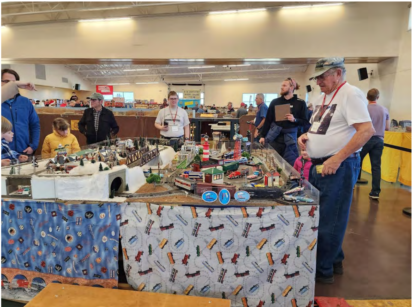
Jon Spargo's traveling exhibit at the NMRA Rails Along the Rio Grande Show