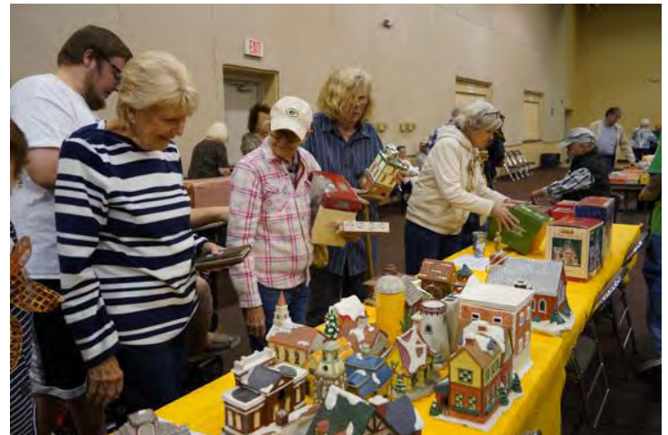
The Division had several tables of items for sale both from consignors and donations