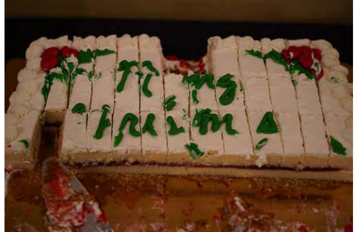
Cookies and cake? If you went home hungry it was your own fault. In fact we saw quite a few doggie bags going out the door