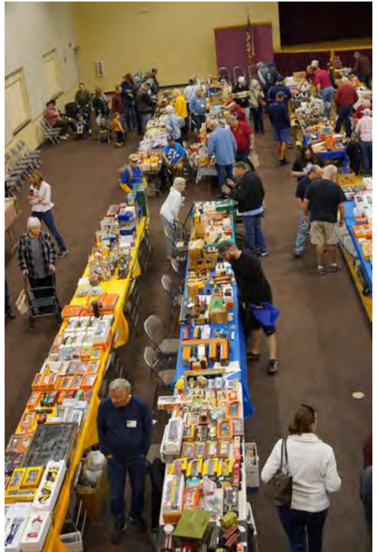
Ten rows of ten tables in each row, plus another ten against the back wall and more yet under the upper deck overhang. A very full house