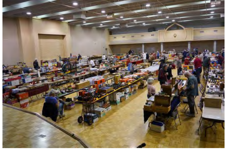
Before the Meet opened we were able to get a fairly good overall view of the Shrine Auditorium