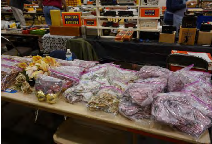
We all like stories with happy endings. Come to the January Meet and hear all about the tree decorations we had in storage and didn't sell at the Meet