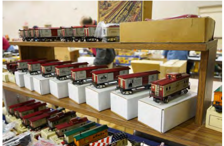
New era Marx, brand new in the box, all lined up and ready to sell