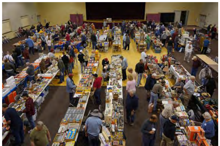
Only a partial view of the over 115 tables that were sold for the show