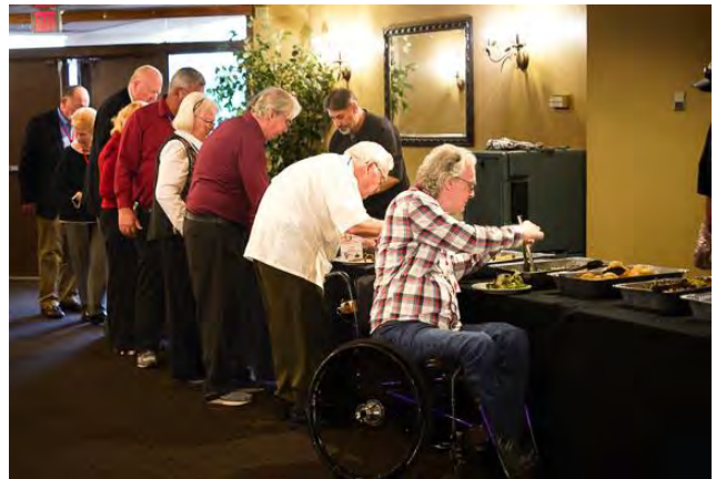
The food line starts with the event catered by DeVito's Restaurant in Phoenix.