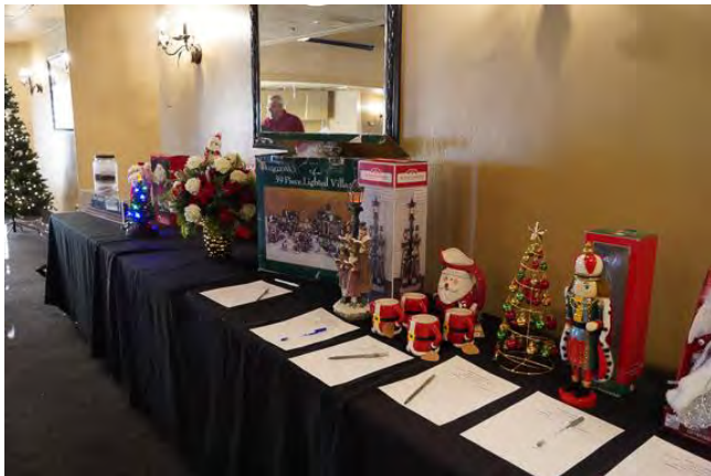
Some of the Silent Auction and Raffle items up for grabs at the party