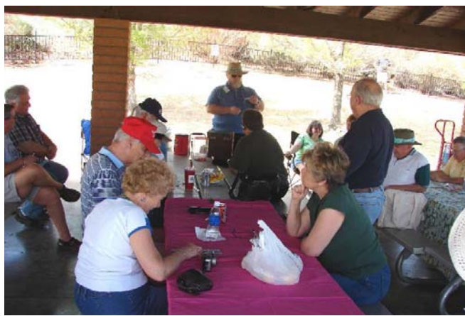
A few of the delighted members at the Spring Picnic.