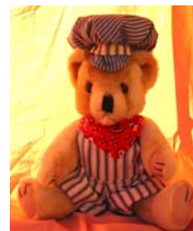
Division's Kids Club mascot "Cub-boose"

The development of each child is different. Each grows differently and plays differently. Below you'll find an outline of what to expect at various stages in your child's life and suggestions about choosing the right toy train products for different ages.