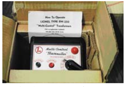
Lionel RW250 Transformer