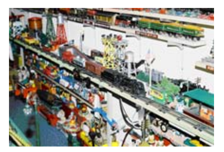
Lionel Outfit 1427WS on the track in Greg Palmer's train room