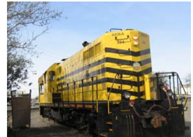
Sacramento River Dinner Train

I bought a fair amount of things at this meet, but nothing can compare to my last purchase. As always, it was a fun meet with a really great Saturday night banquet, filled with many silent auction prizes, of which I won two. Perhaps now that the Turkey Meet is going to be a two-day affair, we might be able to consider a banquet after the Saturday meet. Just a thought . . . Once upon a time it was a “thought” with Nor-Cal and now it is a successful reality.