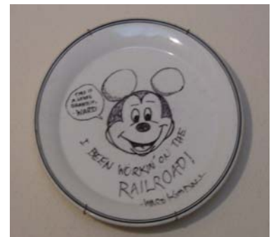
My last acquisition at the Cal-Stewart Meet, a Ward Kimball drawing on a dinner plate.