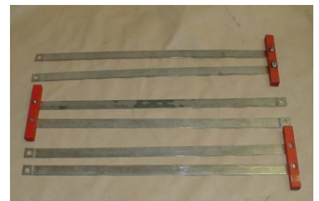
The 1928 model Electricar had sliding pick-ups along a fence with steel rails.