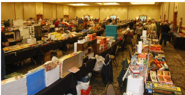
Above: Chaparral Suites and Resort’s Pavilion was filled to capacity with table holders and shoppers.