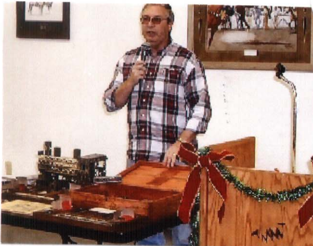
Ed Micale's 1919 #8 Erector Set. The loco is one of many unique pieces that can be constructed from this set.