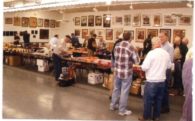
An overview of the trading pits as members scurry to set up their sales tables at the January Meet.