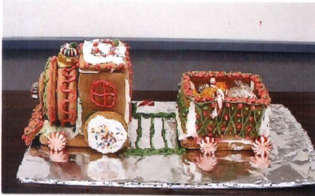
Bill Schulte's "Low Carb?" Gingerbread Train