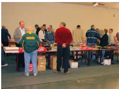
Our members come to the Meets to swap stories and trains.