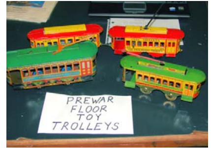
Jerry's pull toy trolleys have very attractive lithography.