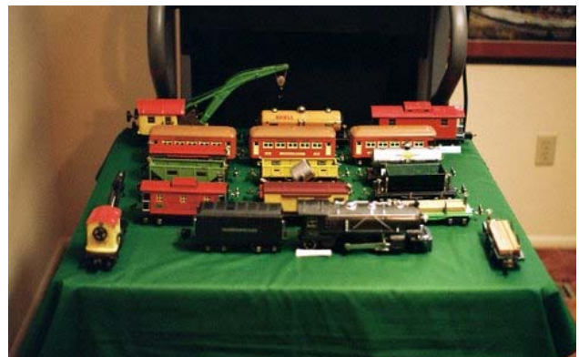
Don Mantay's collection of 600 and 800 series pre-war Lionel cars