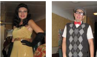
Mystery Dinner Train Actors

Flanked by a 1950's Florida East Coast F-7 and painted in Seminole Gulf Railway colors of blue, yellow, and orange, and pushed/assisted by an older GP-9, the four refurbished streamlined passenger cars were well appointed with period furniture, light fixtures, plus mirrors, paintings, and other niceties. The actors were quite professional and picked up on many of the reactions of the diners to make the affair quite personal for all in attendance. However, the most surprising thing to me was the quality of the food. Amazingly, the highly touted cruise ship did not have any "WOW" meals during our week aboard, but on this one night on a Dinner Train in Fort Myers, there was a "WOW" meal. A 5-course meal, served between acts of the Murder Mystery, was without a doubt the finest of its type we have ever eaten on such a train. This includes 6 trips on the Wine Train in Napa City, California and two other reputed "gourmet" Dinner Trains we've ridden and eaten on in Washington State and Minnesota. Service was also impeccable. We even figured out "Who Done It" but missed the Bonus Question, so we didn't win the Grand Prize.