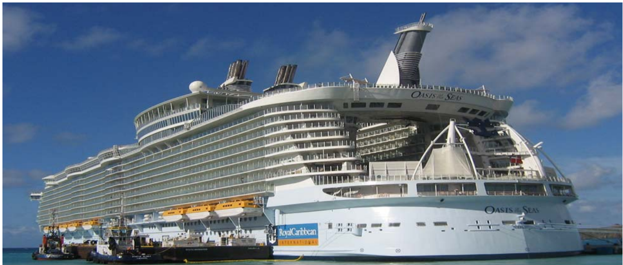
OASIS of the SEAS – World's largest ship @ 225,000 tons

Finally, while on the recent cruise, we obtained some very valuable shopping coupons good in many island countries in the Eastern and Western Caribbean Sea, plus several Mexican resort cities. Should anyone reading this be going on a cruise or trip to any of these places and be interested in any of them (they're free), please contact us at your earliest convenience at christie1wilson@aol.com or 480-837-5344.