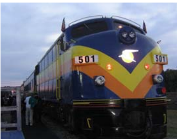
Seminole Gulf F-7 Diesel