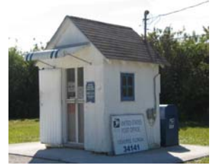
Smallest USPS Post Office

Fort Myers and Fort Myers Beach has long been our favorite spot in Florida, dating back to our early wedded days in New Jersey. We read about this trip in some Kalmbach train publication and thought it would be a nice diversion prior to a week on the cruise we'd booked a year and a half earlier. The fact that it was in Fort Myers didn't hurt its image at all. Driving west on the Tamiami Trail from Homestead, Florida (where the Everglades are located), we passed the smallest U. S. Post Office in Ochopee, an unexpected bonus and another "notch" in one of those 1001 places to visit before you die. The train turned out to be more than we ever hoped for or dreamt about.