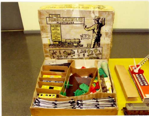
A complete boxed Mexican Marx, aka "Plasti-Marx"