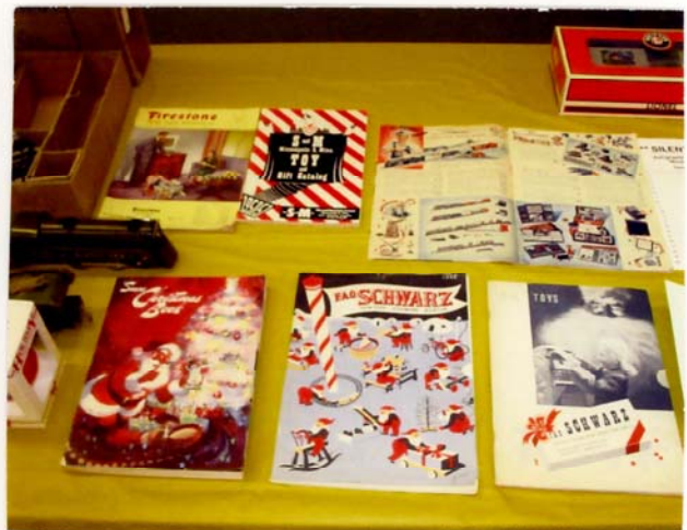
An assortment of store Holiday Catalogs from the 1940's. The 1942 "Firestone" one sits on the upper left.