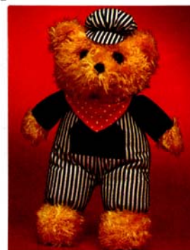
Cub-Boose Kids Club Mascot

Kids Club continues to sponsor varied and interesting pursuits. You can get a "kid" involved, and it's FREE. Just fill in the form below and turn it in to one of the Co-Chairs. We will see to it that it is sent on to the TCA National Business Office.