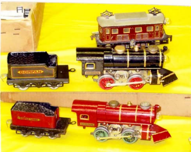
The Bing Electric (top) with Dorfan locos and tenders. Note: 6-wheel rarity (bottom)