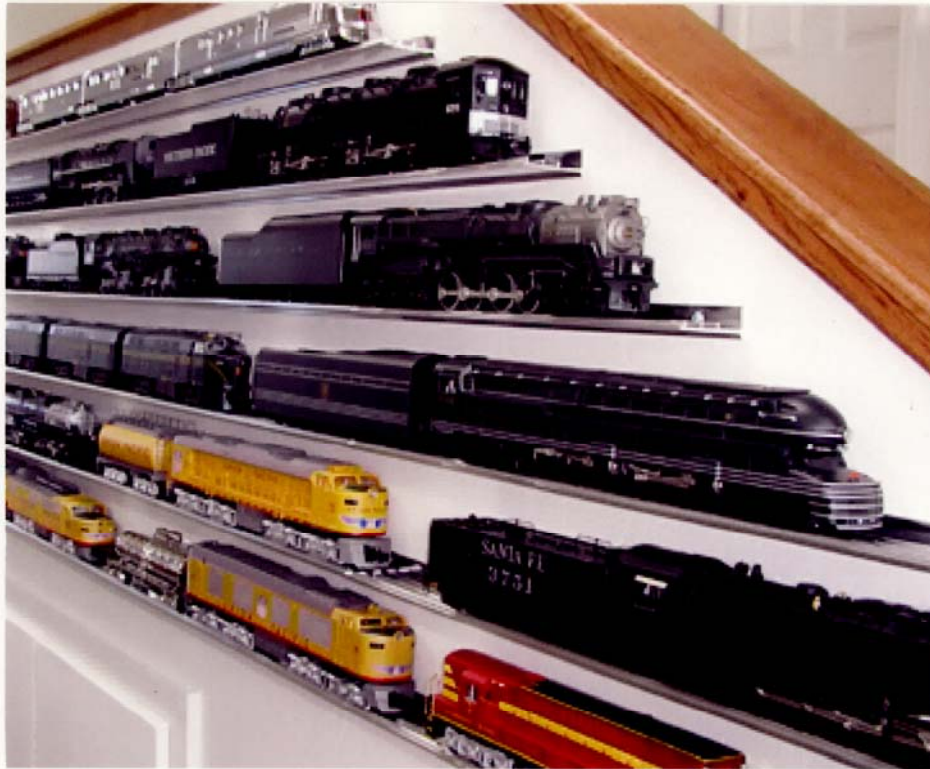
Marlin Benson collects most of the big new engines, and displays them beautifully