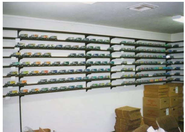
On the right: Tom Stange's train room before the layout with 100's of 25 th Anniversary Step Vans