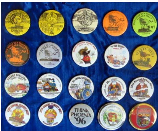
On the left: Turkey Meet badges 1993 to 2009