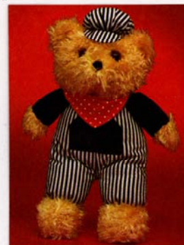
Cub-Boose Kids Club Mascot

Kids Club continues to sponsor varied and interesting pursuits. You can get your "kid" involved, and it's FREE. Just fill in the form below and turn it in to one of the Co-Chairs. We will see to it that it is sent on to the TCA National Business Office.