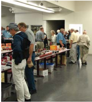
Meet tables abound with toy train items for sale.

Shortly after the meet, the pizzas arrived. Once everyone was stuffed, the Auction began. Items specified to be for the Convention, items from members for personal sale, and items from the Sun City collection made for a sizable Auction and a busy afternoon.