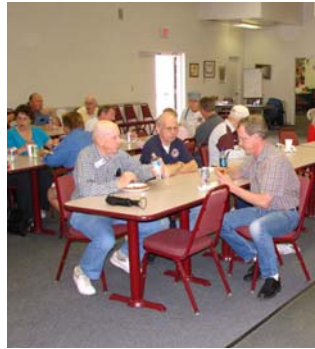
Sales tables convert to a dining areas.