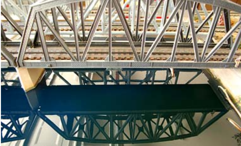
The newly restored river on a nearly 20 year old bridge module.