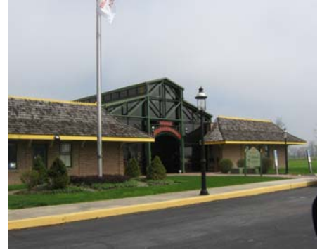
TCA Museum, Library and National Headquarters