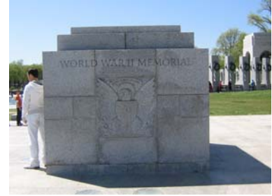
L – Washington Monument R – World War II Monument

Our main destination, however, was Nationals Park, to see a baseball game between the Philadelphia Phillies and the Washington (DC) Nationals. When I pulled into the parking lot for this, the worst team in the major leagues, I was greeted by an attendant asking for a $40 fee. I asked him if I'd made a wrong turn and somehow wound up in New York. He didn't much care for my sarcastic bit of humor.