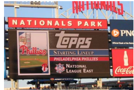
Nationals Park in Washington, DC

Our main destination, however, was Nationals Park, to see a baseball game between the Philadelphia Phillies and the Washington (DC) Nationals. When I pulled into the parking lot for this, the worst team in the major leagues, I was greeted by an attendant asking for a $40 fee. I asked him if I'd made a wrong turn and somehow wound up in New York. He didn't much care for my sarcastic bit of humor.