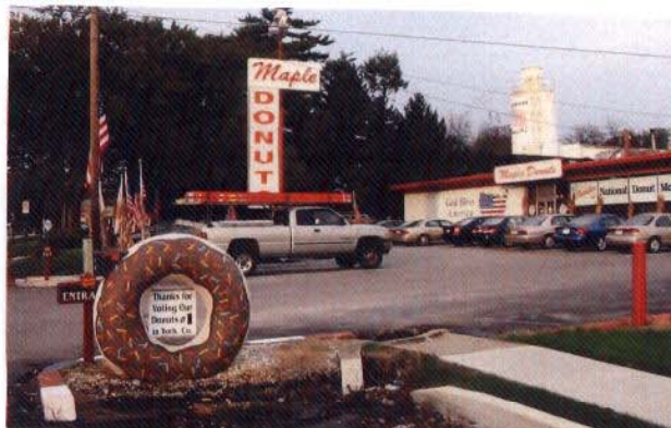
7. The best donuts in the world are Maple Donuts, a York exclusive.