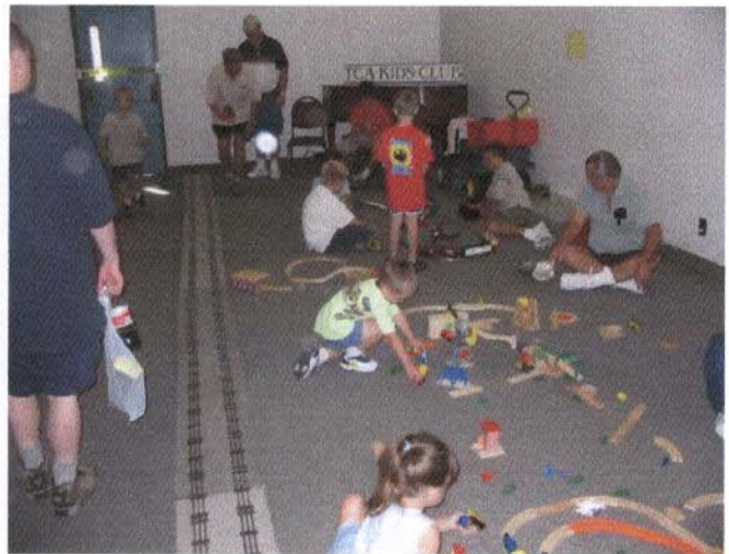
Prior to the wooden railroad empire merger