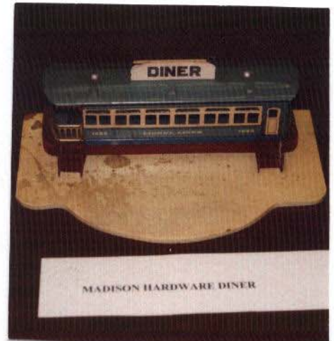
A rare/unusual Pre-War Lionel Diner.