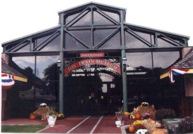
3. The TCA's Headquarters in Paradise Twp., PA, early Thursday AM. Note the "Brick Walk" Railroad Track leading through the main entrance.