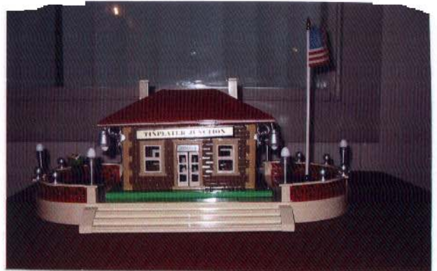
6. The Pride Lines Station and Platform presented to Paul as a present by the attendees at the Roast. The station is known as "Tinplater Junction."