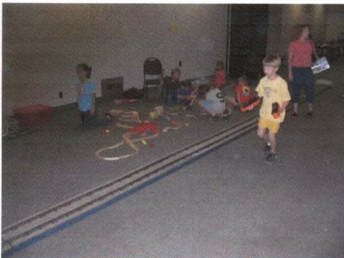
Running to the starting line with Alco's in each hand