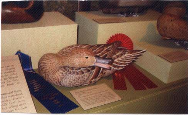
1. Super detailed, hand carved duck decoy on display at the Mercer Museum.

These photos follow chronologically the article on the previous page.