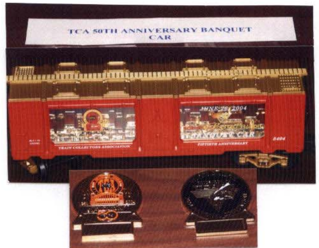
Golden Anniversary Banquet Car with Fort Pitt Medallions.