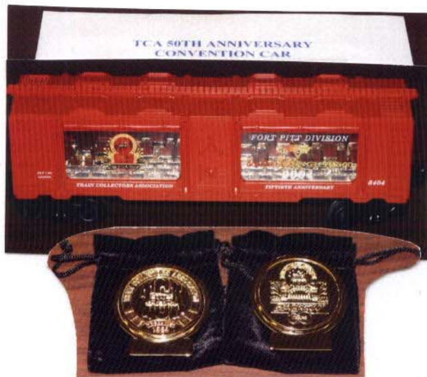
Golden Anniversary Convention Car with official TCA gold covered medallions.