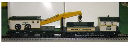
CA & AZ Crane and Boom Cars, a Division Convention offering. This is the "Life Imitating Art" crane.