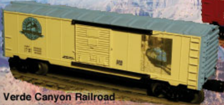
Verde Canyon Railroad