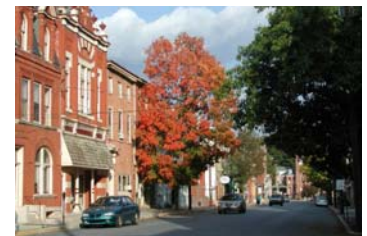
Autumn in Marietta, PA.