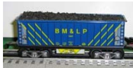
New Marx Black Mesa & Lake Powell Coal Hopper, as seen in Monument Valley, one of Arizona's scenic highlights.

The Grand Canyon started things off with the first ever HO scale train set for a TCA Convention. Two Harriman style passenger cars and a Water Car, the same as the ones used on the Grand Canyon Railroad, were offered in a boxed set of three pieces and manufactured by Con-Cor, a Tucson, AZ based company.