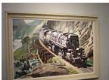
One of the Howard Fogg paintings at