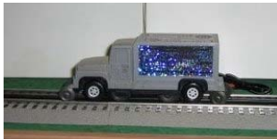
The On-Track Step Van made to celebrate the 25 th Anniversary of the Division in 1976.

For whatever reason, it wasn't until 1996 that the next limited edition offering made its appearance. To celebrate the 25 th Anniversary of the Division, a truly unique piece was selected. Up to now, throughout TCA's Divisions, all commemorative offerings had been static. LTI had just introduced their On-line Step Vans. We were able to contract with Lionel for 240 of these "newbies," but the ones from the Desert were quite different. First of all they were made of gray plastic. All other consumer and club issues (LCCA) were either orange or blue. The front side doors, rear doors, and license plate were all laser engraved with lettering and numbers, so they could never be confused with any other factory release. To top them off a holographic three-piece decal was affixed to the van's sides and roof. These are truly hard to find today – a birthday present to ourselves and anyone in TCA who wished to order one.