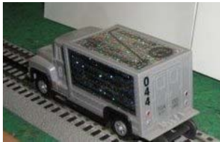
A rear view of the same van, showing the serial number 44 and the laser engraved numbers on the rear door and license plate.

In 1997, the Division went into overdrive, making available a plethora of offerings to celebrate not only Arizona, but also the fact that the Desert Division was hosting its first National TCA Convention.