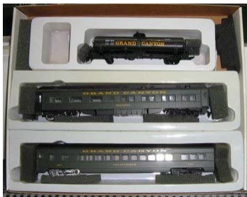
A TCA first was this HO offering depicting cars from the Grand Canyon Railroad.

In 1997, the Division went into overdrive, making available a plethora of offerings to celebrate not only Arizona, but also the fact that the Desert Division was hosting its first National TCA Convention.