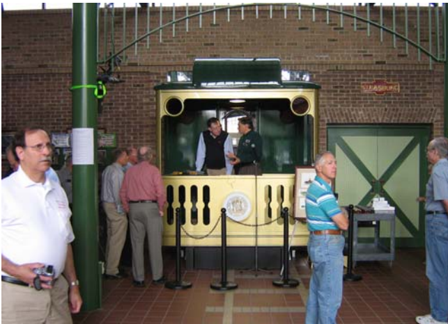
The Observation Deck is ready for York Wednesday. A generous donation from the Desert Division helped defray the costs.

For reasons known only to the manufacturers of the Observation Deck, they were a tad late with the Monday morning delivery, as they pulled into the parking lot at 300 Paradise Lane on Thursday morning at 9:30. Like Santa in "The Night Before Christmas," they "went straight to their work." By noon all that remained to be done was to establish the electrical connection for the rear warning lights and TCA Drumhead. On either side of the Observation platform are two railroad portable steps, making access to the deck quite safe and easy. If anyone reading this has ever ridden the Wine Train in Napa Valley, California, the resemblance of the rear of their Platform Observation Cars and the facsimile in our TCA Headquarters is remarkably similar. Yet another reason to visit your TCA Museum, Library, and Headquarters.