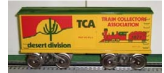
The very first Desert Division Commemorative car was a colorful McCoy Standard Gauge Box Car.

Such beauty and history have not been lost on members of the Desert Division in terms of developing and issuing commemorative pieces of railroad rolling stock and related items. The first of these was a McCoy Standard Gauge Box Car in bright yellow, green, and red. It celebrated the topography of the entire Division, from El Paso on the extreme southeast to Lake Meade and the Hoover Dam on the northwest.