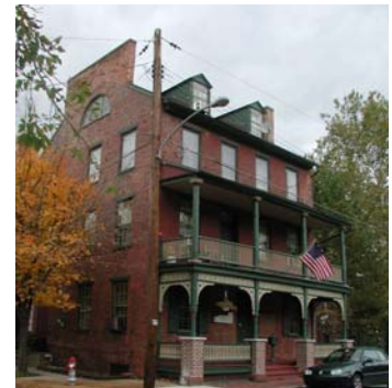
The Railroad House Historic Bed & Breakfast