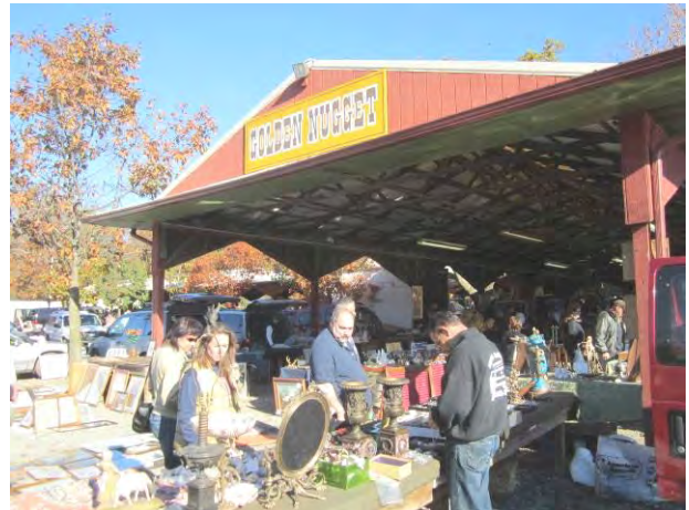
The Golden Nugget flea market in Lambertville, New Jersey