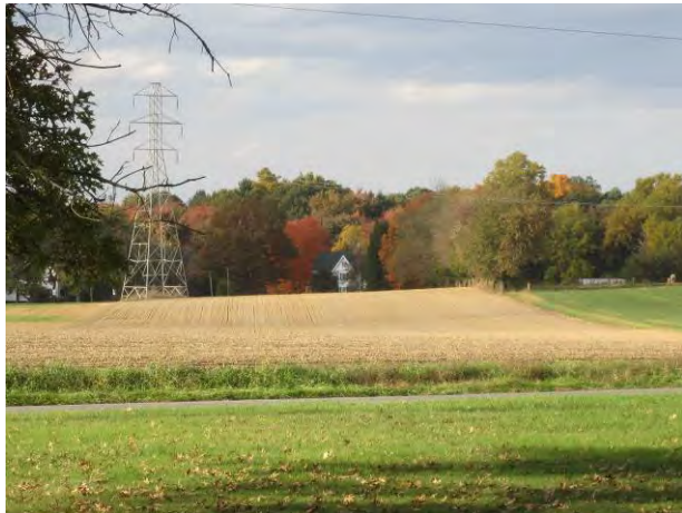
Autumn Foliage in rural Pennsylvania