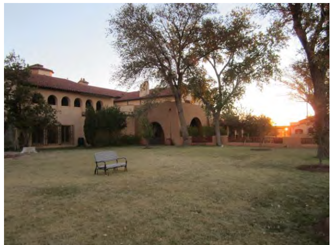
Sunrise at La Posada. This is always a "must stop" for us either for the night or a meal