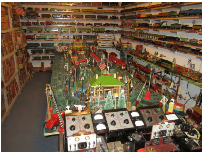
The "Business end" view of Greg Palmer's pre-war layout room