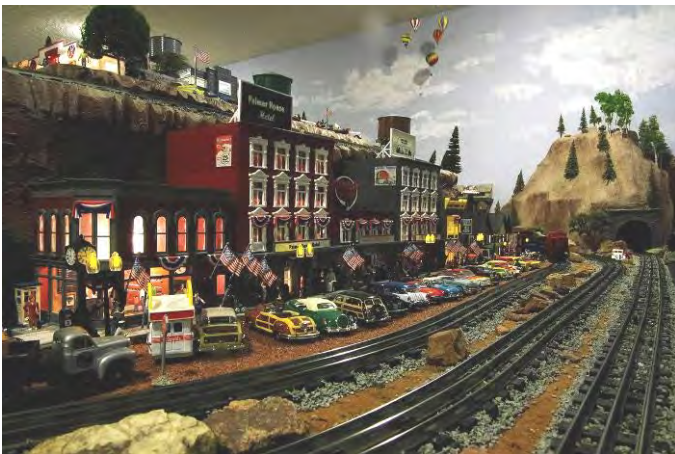
You can easily lose count of all the cars and people on David Nycz's layout