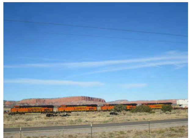
A typical view on I-40, BNSF in the pumpkin paint scheme