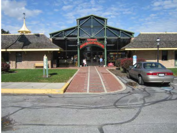
National Toy Train Museum and headquarters of the TCA