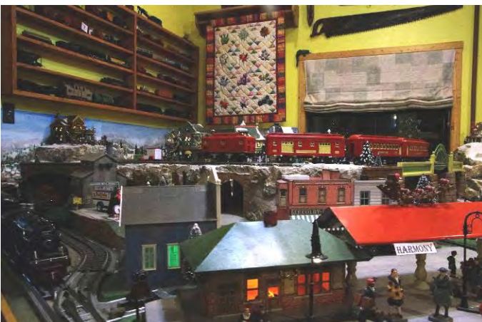
Scott Eckstein's recently updated layout was also a stop on the private layout tour