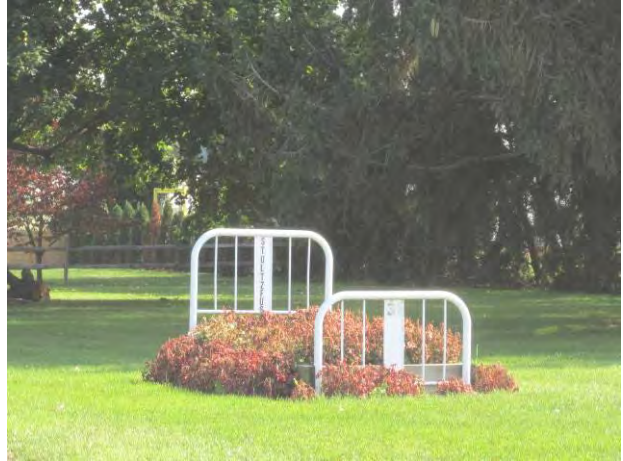
Literally a FLOWER BED by a nearby TCA Museum's "creative" neighbor