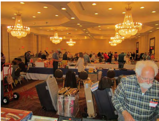
Inside view of the Albuquerque Sheraton Downtown at the Pumpkin Meet

If you have never taken the opportunity to spend an overnight in Winslow's Harvey House, La Posada, the Pumpkin Meet will afford you the opportunity to do so. Only 2½ hours from the Valley, it offers a combination of fine dining, ambiance, history, and a never-ending stream of trains. You can do nothing but whet your appetite for a weekend of being in love with this hobby. We've already made our reservations for next year's Pumpkin Meet. Won't you join us for dinner at Rudy's on Saturday night, next year, about this same time?