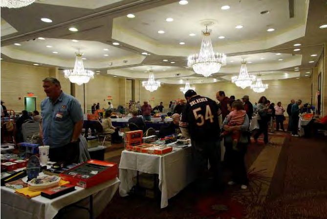
Another view inside the Pumpkin Meet. Division members were treated to a private layout tour.