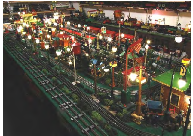
The magic of Greg Palmer's layout is when the lights go out and the layout lights up