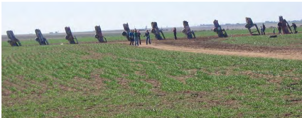
Upper Left – Rudy's BBQ Albuquerque, NM a Food Channel Top 5 BBQ joint - Upper Right Amarillo's Big Texan, where 72oz. never looked so big Middle Right - Oklahoma City's Alfred P. Murrah Federal Building Memorial - Middle Left Where we are all headed, St Louis and the Arch! Bottom - No drive on I-40 is complete until you stop at Cadillac Ranch...