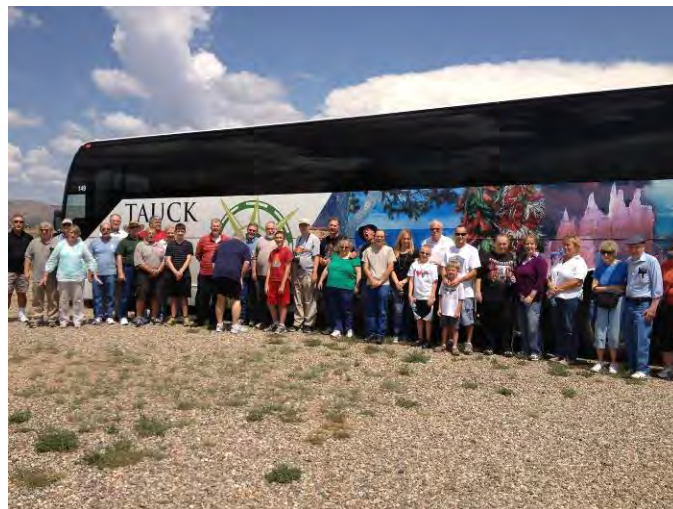
The bus stops here. The riders from the GCMR bus as they arrive at Rancho Atonna