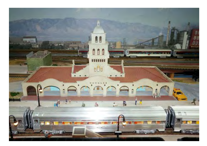
Peter also added a beautiful replica of the Douglas, Arizona train station