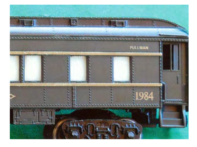
Close-up of the area with the missing TCA logo, no evidence one was ever applied or removed