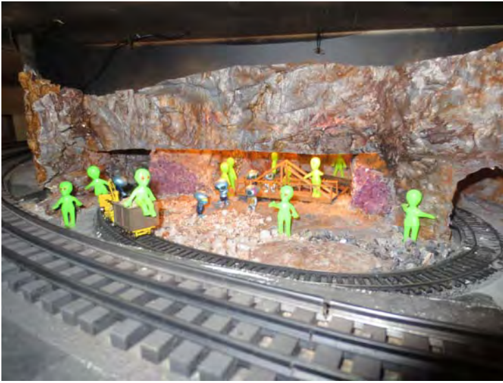
Of course the aliens are busy working in the mines under the layout as well