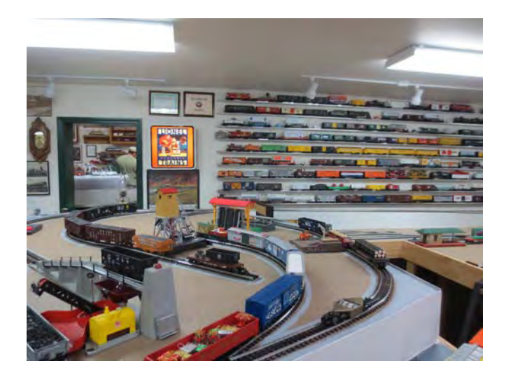
You guessed it, still admiring shelves of trains and trains running throughout the rooms