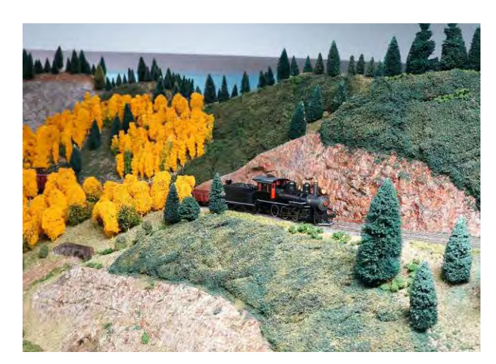
Peter Atonna's ever changing layout now includes a narrow gauge line