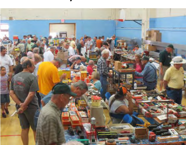
The show is open; it was a busy day for the sellers and bargains for the buyers

The <u>Dispatch</u> is published monthly except July and December by the Train Collectors Association, Desert Division, 1119 W. Plata Ave., Mesa, AZ 85210-8250. This issue is Volume 42, No. 7 (Summer, 2013).