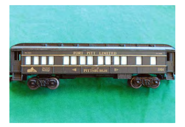
Side view of the 1984 City of Pittsburgh with four wheel trucks and missing TCA logo