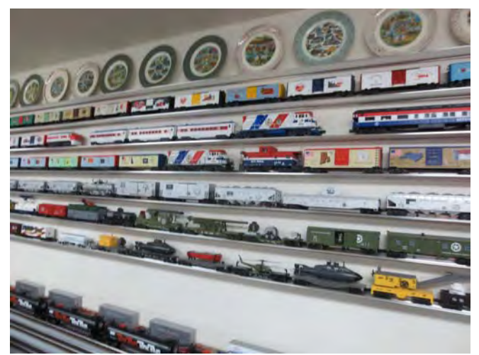
Still another wall of trains at Marlin's open house. Well laid out and lots to look at and admire