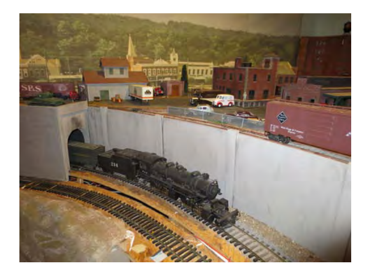
The detail and planning is evident wherever you look and your eyes just imagine what is coming next