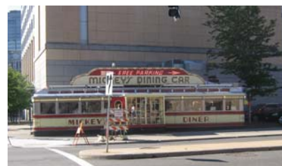
Mickey's Diner in St. Paul, MN