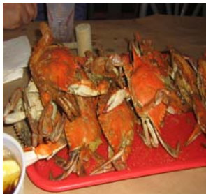
Fresh Baltimore seafood

In the “Hill Country” of Texas, we followed long freight trains along I-20 to the Museum of the Pacific War in Fredericksburg, and walked through the youthful home of President Lyndon Johnson. In Round Rock, Texas we saw minor league baseball at its finest from an exclusive Diner's Club and then went north to Fort Worth for a spectacular performance of Mozart's Don Giovanni . Here we were invited to a VIP reception by a member of the Opera Guild's BOD, who happened to be seated next to us. Sometimes you just get lucky.