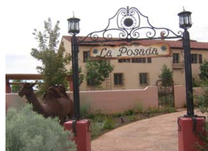
La Posada, a restored Harvey House, is a perfect place to relax, dine, spend a night, or just watch trains pass by.