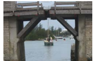
World's smallest drawbridge

After the Convention we took a cruise to Bermuda, a place we last visited in 1985. Traffic has increased in this island nation by tenfold. We used the ferries and the buses to get around to the various cities and sights, including the smallest drawbridge in the world and the sandy railroad path, which is all that is left of trains in Bermuda. It was a very relaxing visit and we were able to take a unique trip in which we donned diving helmets and actually walked on the floor of the Atlantic Ocean!