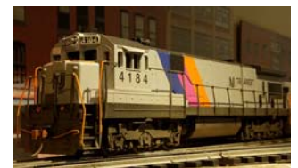
Top: NJ Transit car Bottom: E-8 Diesel Ammeter