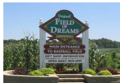
Field of Dreams in Iowa