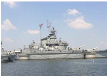
Battleship Cove features the USS Massachusetts .