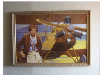
Amelia Earhart's childhood home in Atchison, Kansas