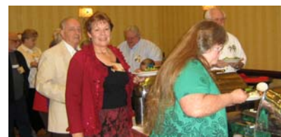
Everyone enjoys a good buffet.

Everyone went away filled with good food, at least one gift or prize, a happy smile, and most important, that wonderful holiday spirit which characterizes this time of the year.