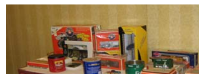
Three of six raffle prize lots.