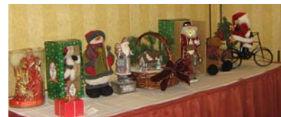
Auction pieces for any budget.