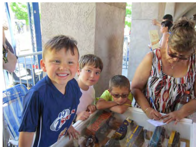
Happy children view trains while the adults fill out raffle tickets for our drawing