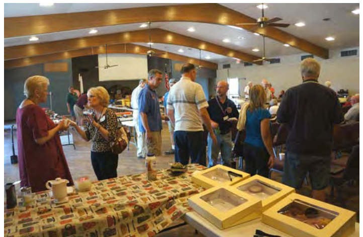
Still the happiest place at the meet (unless you win the Hudson Hundred) the coffee club was well prepared for the day