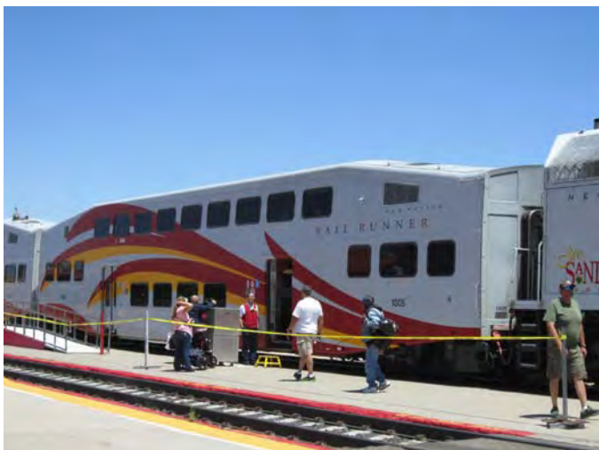
All of trains were open for tours