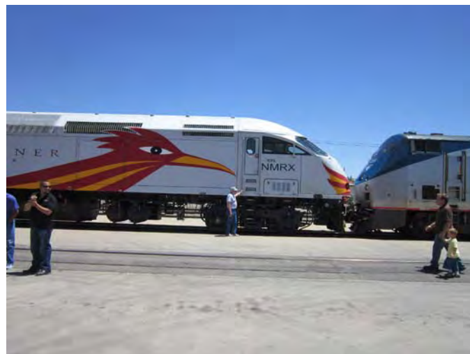
The Rail Runner and Amtrak locomotives