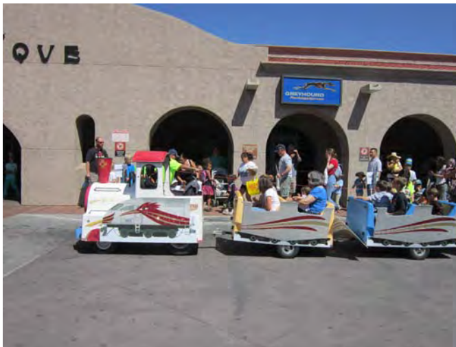
Children's train ride was a big hit all day