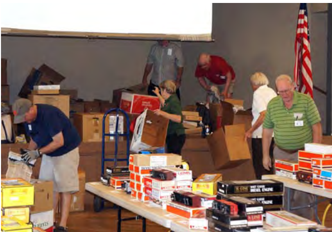
The auction crew already very busy before the May Meet. Getting 180 lots ready in record time!

Following the raffle prizes (space does not allow us to list all the winners but they were all very happy) the Pizzas arrived which made for a great close to the meeting and a great way to kick off the 19 th Annual Pizza Meetza. Be sure to be around next year!