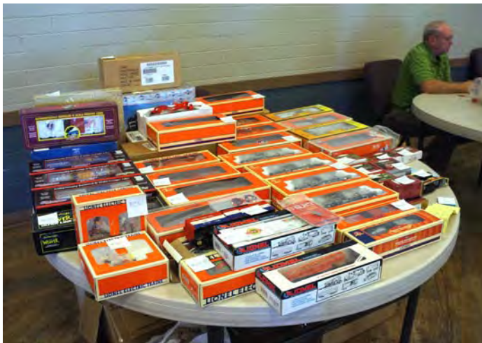
Where's the seller? Maybe getting a sneak peak at the auction items?