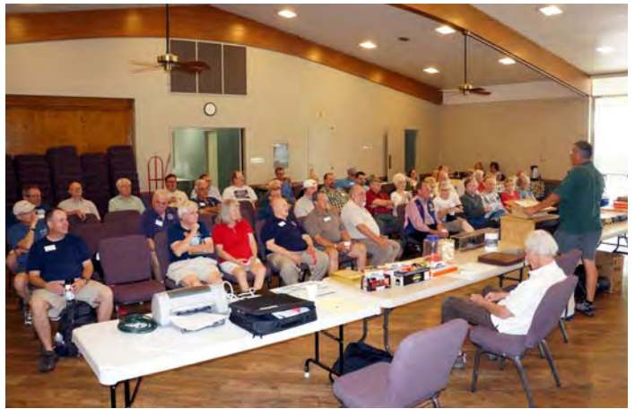
Had to shrink the hall a bit to get all the trains lotted and set up before the auction