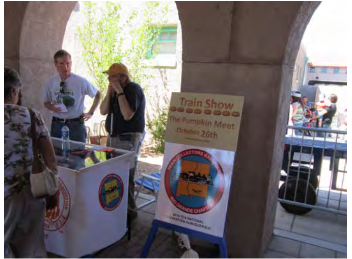
Our new tripod and signs