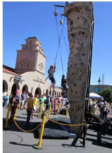
Climbing wall was only 50 feet from our location