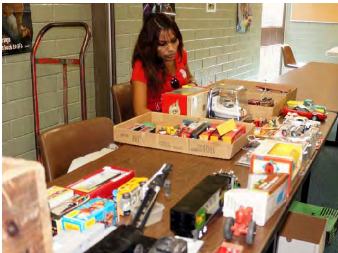
Table sellers were all set up waiting for the crowd that never quite arrived