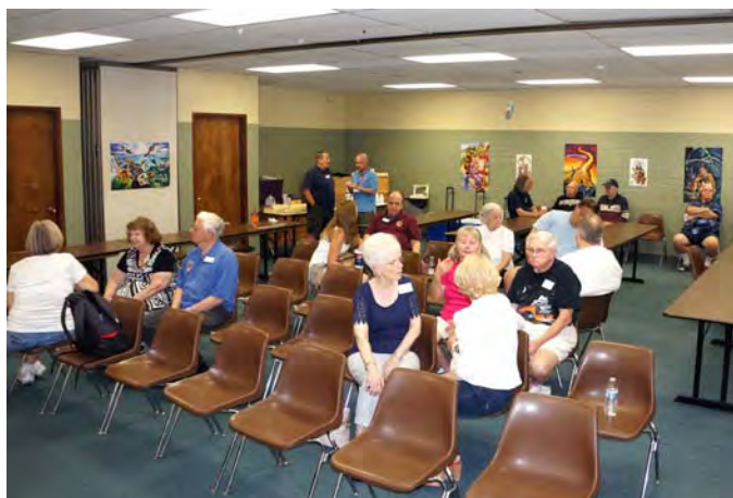
A smaller than expected crowd for the June Meet. The room did fill up more than this, but we still wondered where everyone was hiding...

The educational segment was not announced and a very eclectic collection of items were on display.