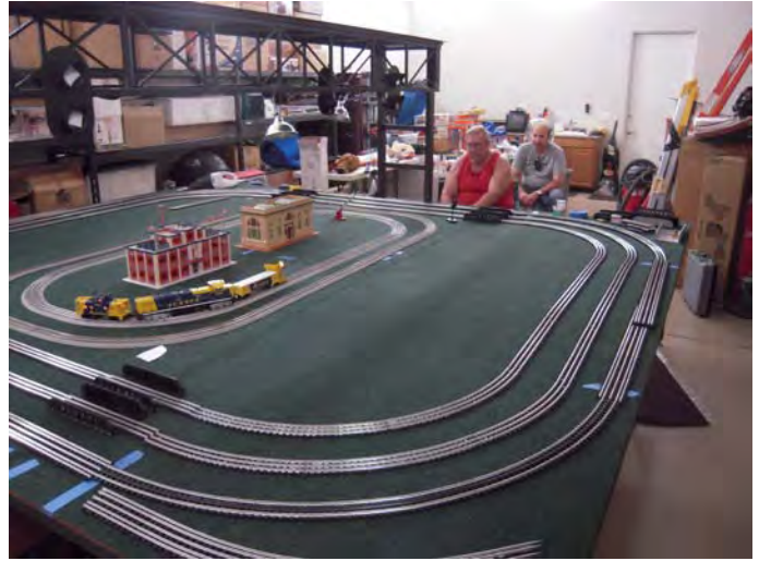
Yes, we live in Arizona and it was over 110° that day, but the first train to run on the module was an Alaska Railway