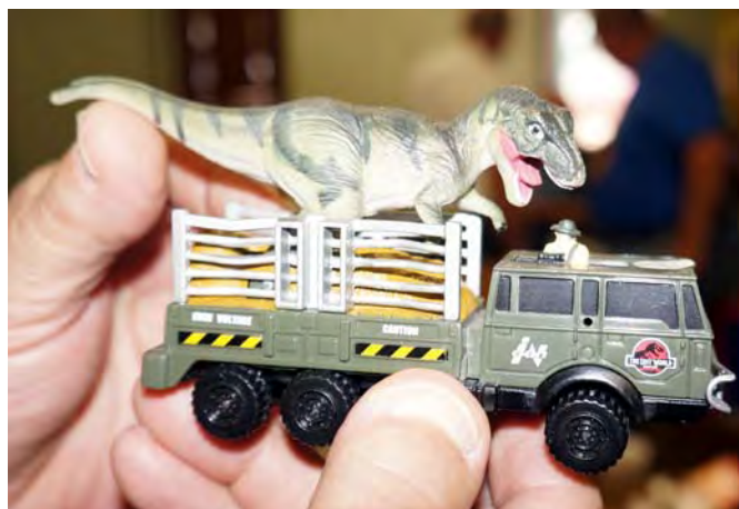
You can find just about anything for your layout at a Division Meet