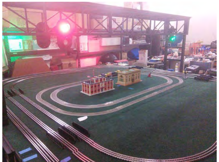
We have blinky lights! The signal tower lights are running on a traffic light circuit and power a pair of 5 watt LED lamps inside of a "Malibu" yard light.