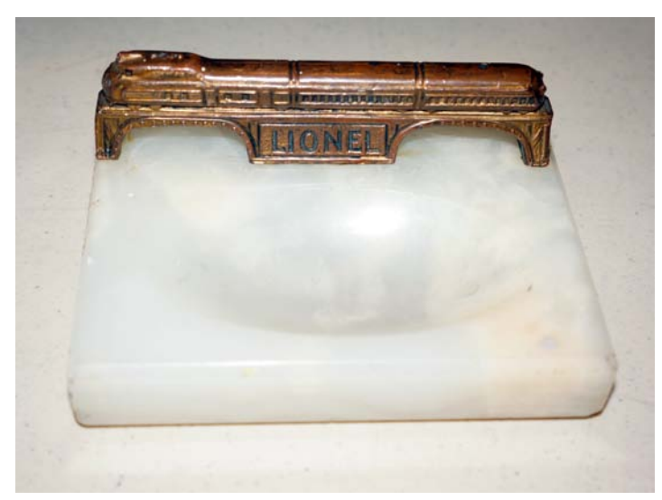
Here is a close-up of the Lionel paper clip holder that Paul Wassermann brought to the meet. Very Unique!