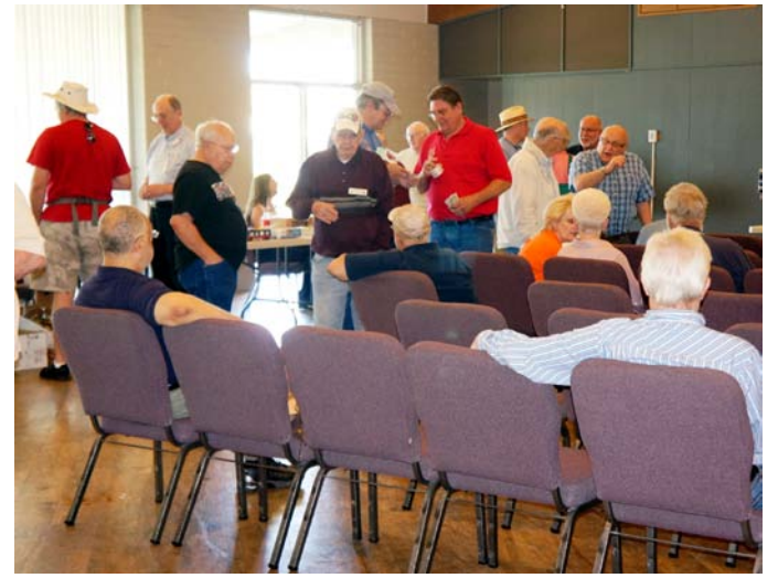
Looks like everyone was in a talkative mood