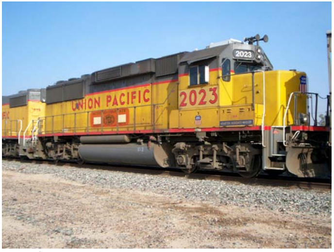
UP's 2023 now in compliance with TCA Standards