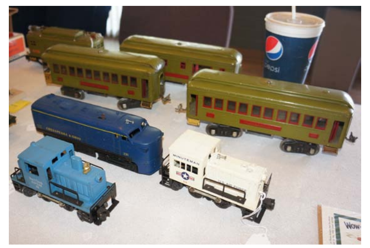
Here's a nice assortment of trains for sale. A little bit of everything for every taste