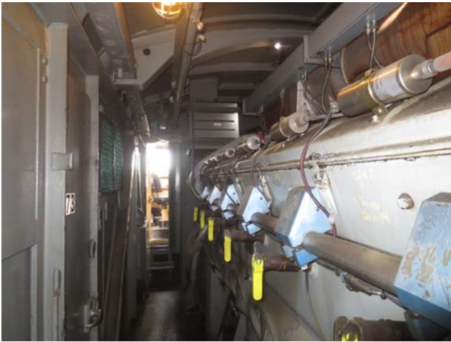
A look at the diesel motor which keeps this PA running

I had full reign to walk around the entire engine's nooks and crannies, including seeking out its hidden video camera, the contents of which are given to CHiPs at the conclusion of each run. WHY? Too many autos still make "S" turns around safety gates across the roadways as the engine is approaching. That's not only dangerous, but illegal and is a $450 fine! I witnessed several cars make the "S" turn around those downed gates as we bore down on them between Napa and St. Helena. Not a smart thing to do!