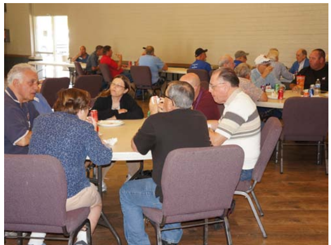
And of course telling a joke or three after lunch helped keep everyone in a happy mood