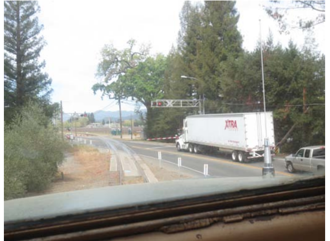
A dangerous crossing – a vehicle played "chicken" and did an "S" turn around the gates as we approached

Conductor as we traversed the 30-mile route. It was interesting that the speed of the train varied according to contracts in place with multiple wineries along the route. There were also stops at a few of the wineries to drop off and pick up patrons as part of special Winery and Wine Train Tours.