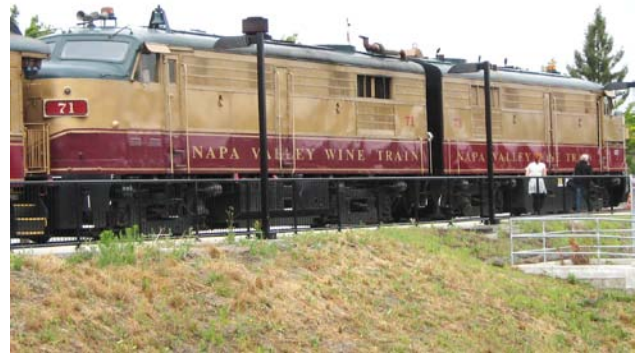
A Pair of former 1950 Canadian National PA's pull the fabled wine train

Did you know that the "Yankee Clipper," Joe DiMaggio, and Wyatt Earp, the gunfighter of OK Corral fame, are buried in Colma, California, just south of San Francisco? These are some of the amazing things you can learn when going to the Nor-Cal half of the Cal-Stewart Meet.