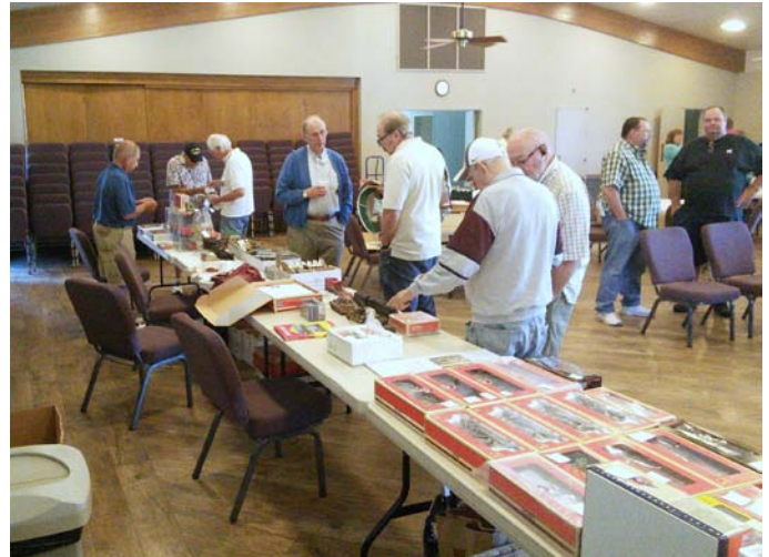
We also had sales tables up and running on both sides of the Hall, it was a very busy Meet