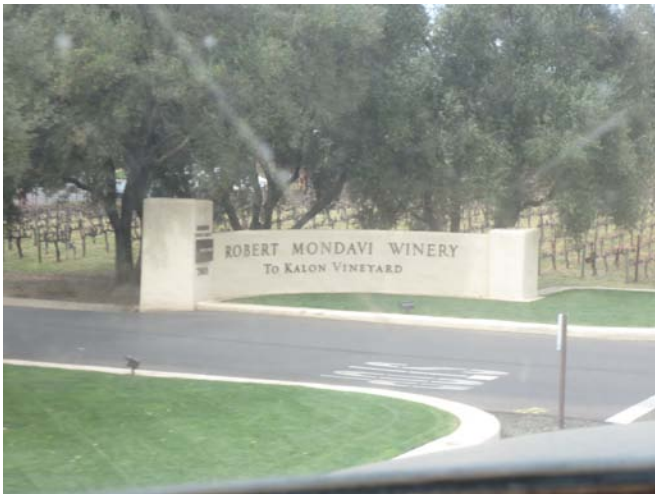
Among the many famous wineries we pass is the world famous Mandavi Winery

I had full reign to walk around the entire engine's nooks and crannies, including seeking out its hidden video camera, the contents of which are given to CHiPs at the conclusion of each run. WHY? Too many autos still make "S" turns around safety gates across the roadways as the engine is approaching. That's not only dangerous, but illegal and is a $450 fine! I witnessed several cars make the "S" turn around those downed gates as we bore down on them between Napa and St. Helena. Not a smart thing to do!