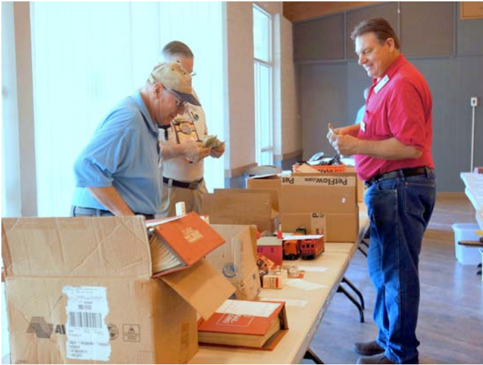
Some early browsing was going on even before all the lots were out on the table for the auction

FOR THINGS THAT DIDN'T FIT ELSEWHERE or BREAKING NEWS