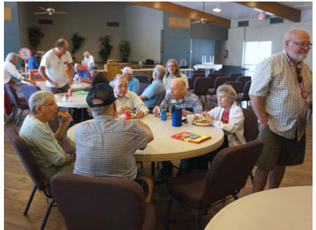
Seems we had a bigger than expected crowd, but we still had enough for everyone