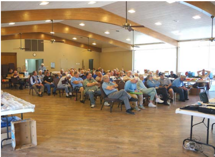
We really did have a full house as you can see in the picture, quite a contrast from a month ago