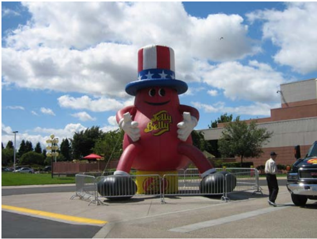
The Jelly Belly Factory Tour is fantastic for "kids" of all ages