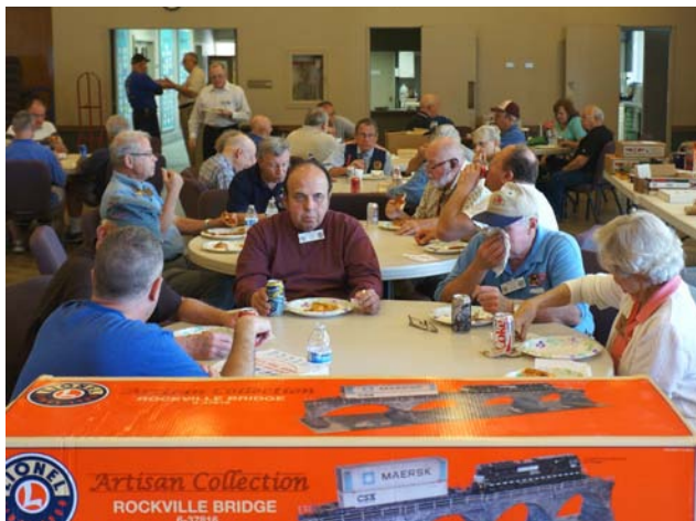
Having lunch right next to some of the auction items helped to keep everyone interested