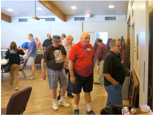
The line formed right after the chow bell was rang and the Pizzas were still hot