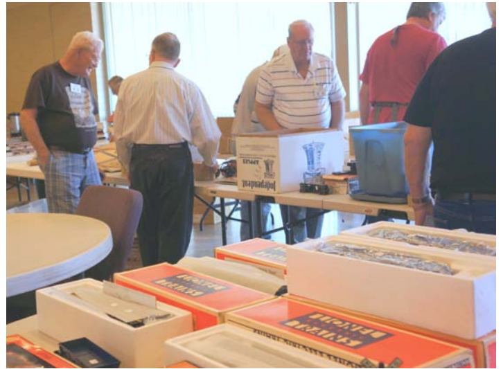
That of course led to more browsing by more people. It was a great auction, Thank you for all who helped putting it together and who participated