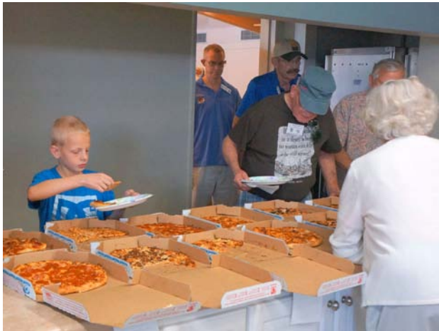
With such a wide selection of pies, everyone seemed to find a pizza they liked