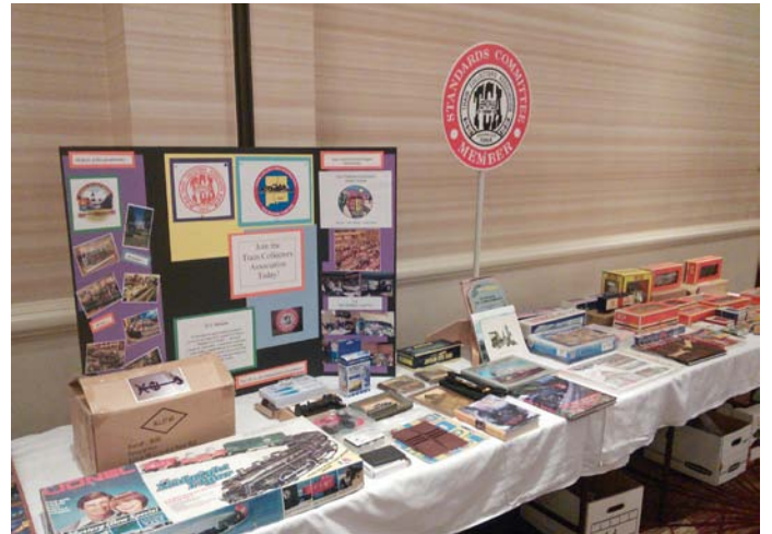
Raffle prizes galore! And information on how to join TCA and the Chapter