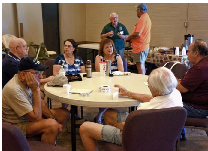
A good reason to attend our next meet, a free cup of coffee and time to relax with friends