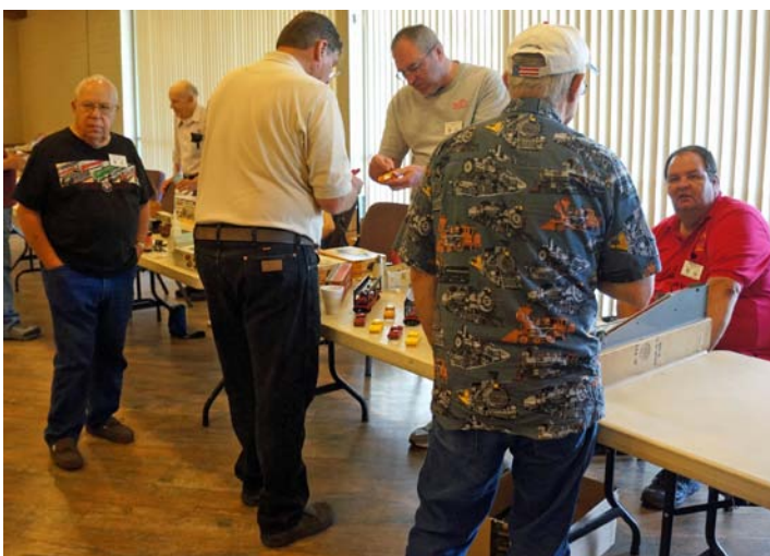
Not a lot of table sellers but those that were there looked busy