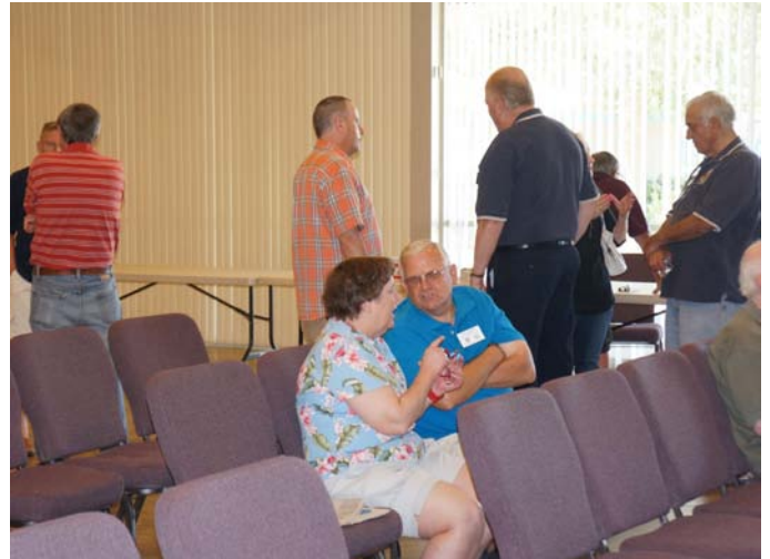
Look at all the conversations going on here, everywhere you look people are saying how great to see you!