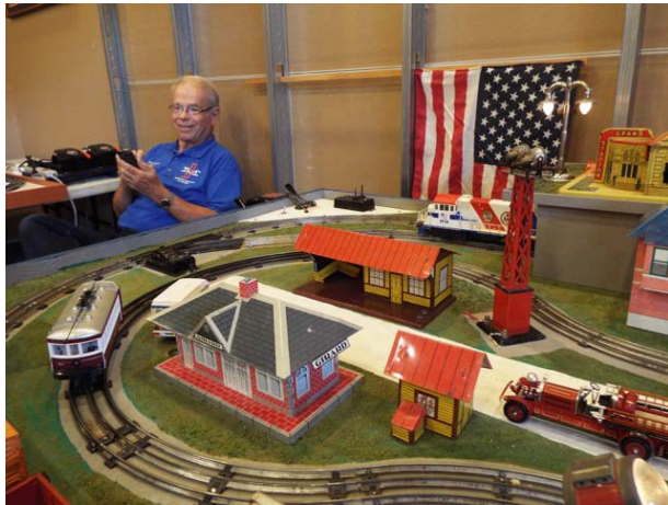
Here I am not waiting long to run my trolley from the Convention