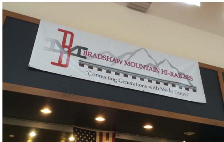
Our sign over the entry