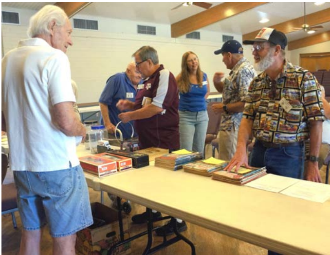
Yes, the magazines are free, please take them...