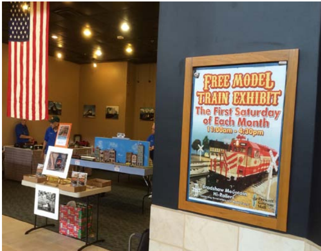
The entry from the mall