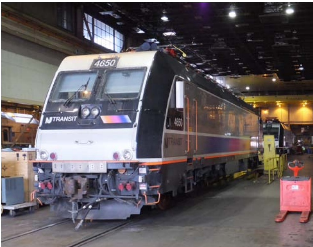
Angelo Lautazi was able to go on some interesting tours and shared some pictures from them