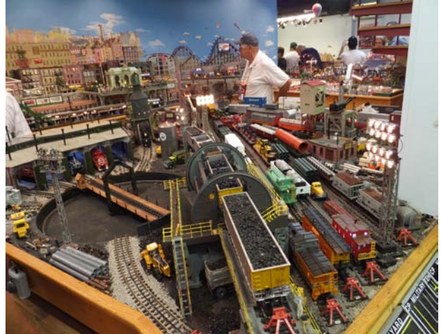
Quite a freight operation that even includes a coal tipple in the yard