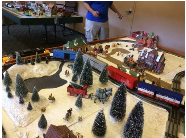
Fourth of July colors were pretty subtle on my Polar Express layout. The Milwaukee EP-5 came from the Convention, my big purchase there.