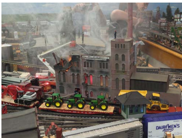
Angelo Lautazi took this great photo during a visit to Phil Kloop’s layout. Real smoke and drama in this scene