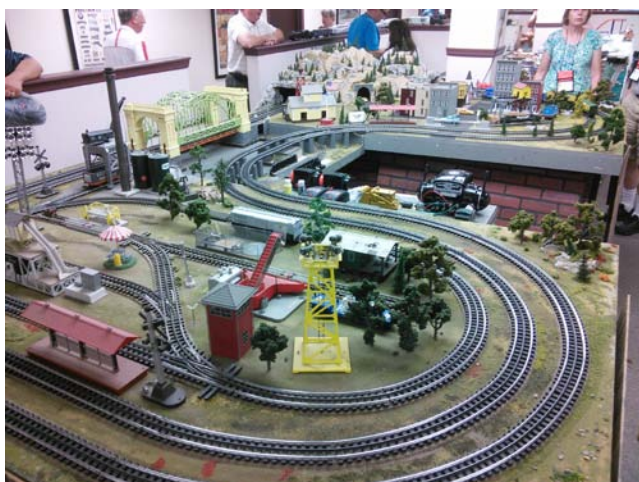
In another room The NJ Hi-Railers had this well known layout from the HBO series The Sopranos where Bobby Bacala got “whacked”