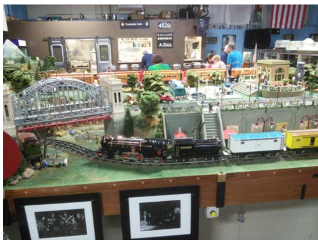
The New Jersey Hi-Railers had a gorgeous main layout and former TV host Tom Synder’s beautiful Standard Gauge layout