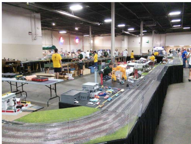
Think the youth are missing from our hobby? Checkout this huge module from the Sommerset NJ 4-H club manned and built by members under 18

More pictures and videos are available on the clubs facebook page