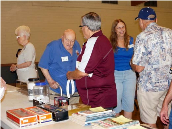
Before the meeting raffle ticket sales. Two the five people seen here won prizes