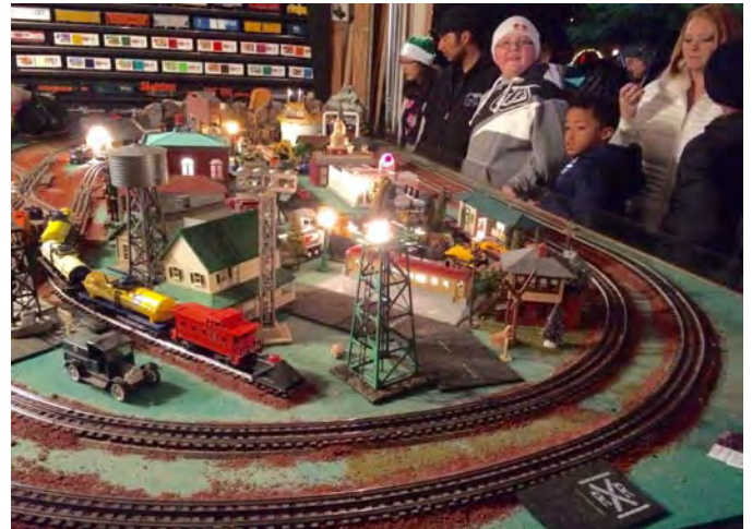
The garage holds Terry's O gauge layout which they see first