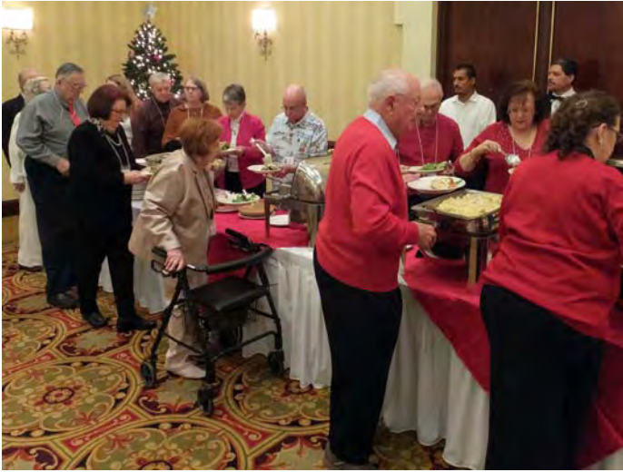
The food line moved fast and the food was great