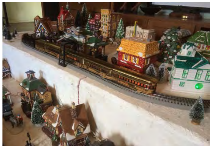
Here is a nice view of Peter's Marx