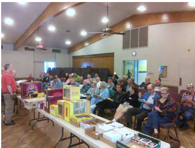
Very good turnout for the November auction

The next Division meeting is set for January 9 th and I hope you plan to attend to kick off the New Year.