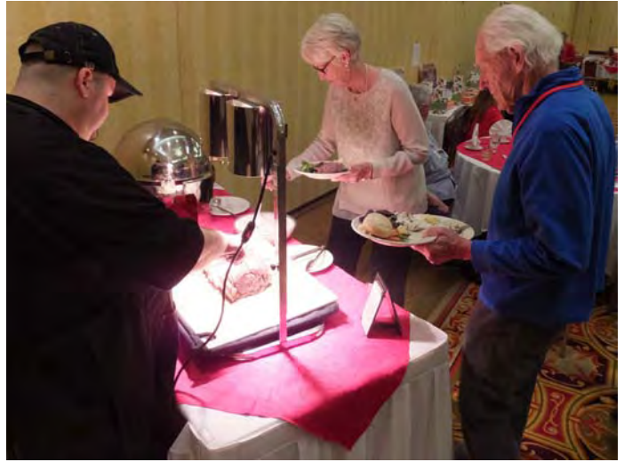
After passing through the buffet line the next stop was the carving station