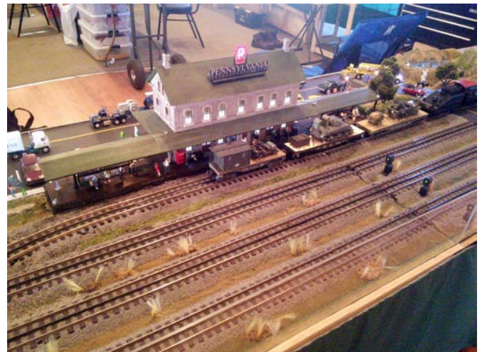
They also had a nice period passenger station complete with troop train and military vehicles