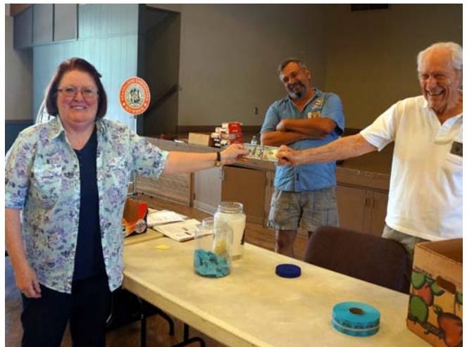
Seems the Hudson Hundred never quite made it to the winners pocket last month.