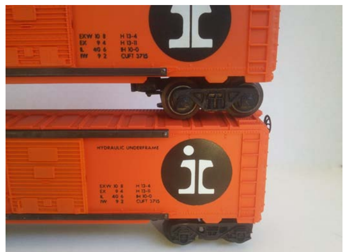
Same car? Well besides the difference in the trucks the IC logo is also noticeably different