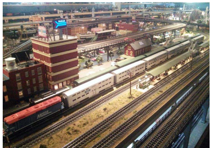
The layout is basically a folded dogbone with several mainlines. One side features Chicago. The other Los Angeles, or a trip down Route 66