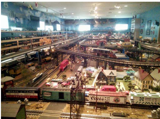
The train room has grown since we last saw it three years ago. This is a view from the Chicago side complete with the "L" and subway