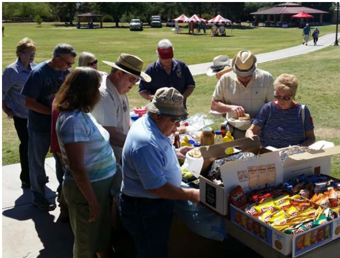
A little organization goes a long way to make for faster service. Thanks to all who pitched in and made the day enjoyable for all