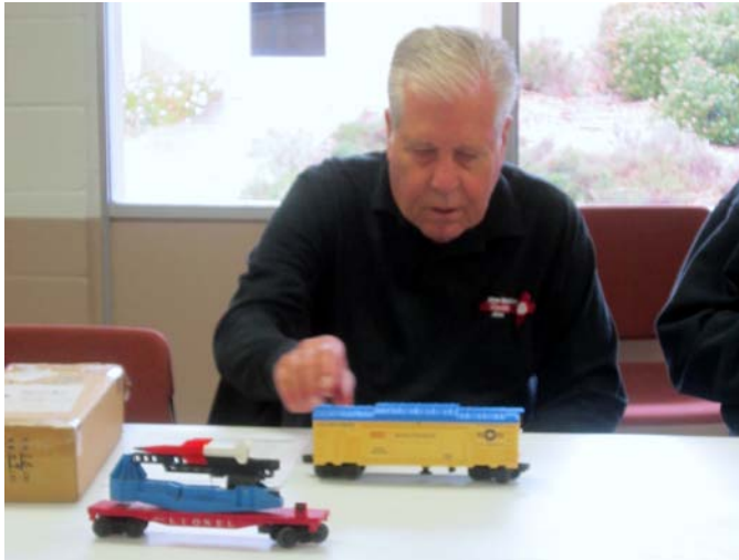
Art Lites showcasing is Lionel 3666 Minute Man Boxcar and 6650 Rocket Launcher