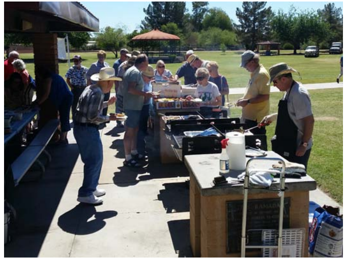
The line formed quickly once the lunch bell rang. Beside the chefs several members wives helped get things setup as well.