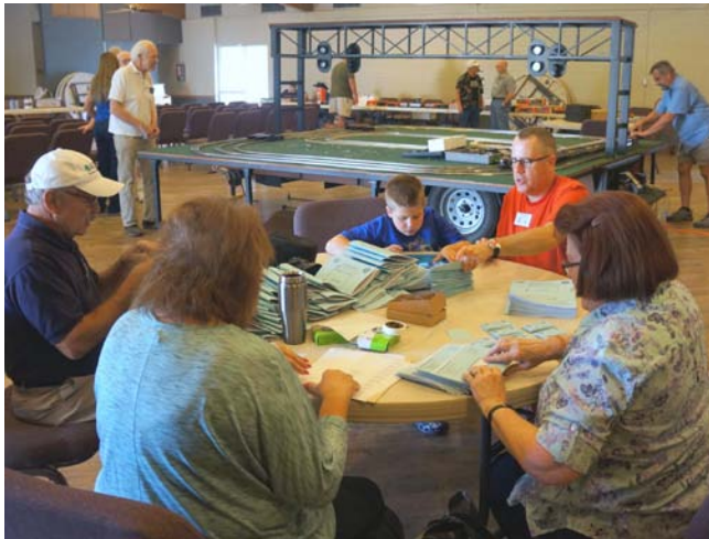
While one group works on the trailer the other is working on getting your rosters ready to mail