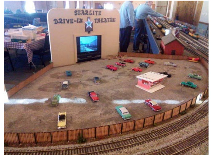
Drive-In Movies were a common site on corner modules at York. This one belonged to the North Penn S Gauge Club