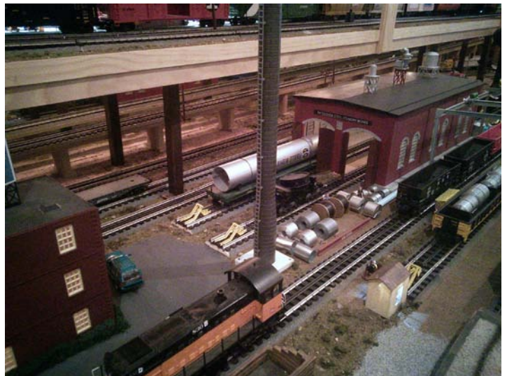
There were several nice industrial areas on the layout so it was hard to pick one over the other