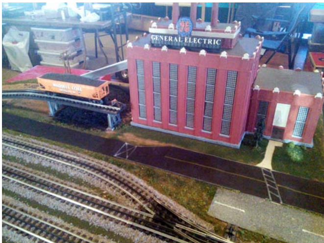
The Lower Susquehanna Valley Modular Group had this nice Power Plant and coal dump operation