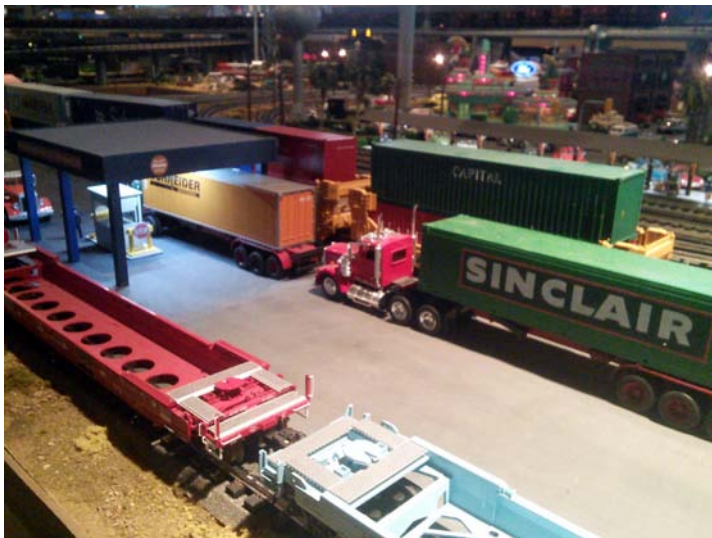
There were several intermodal yards on the layout, this one is near the Port of Los Angeles area