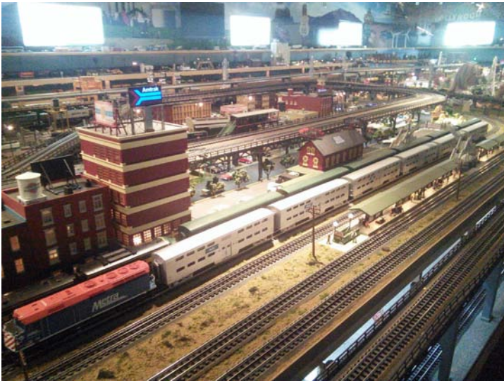
Nice view of the Chicago side. If you look close enough you can see the "L", the METRA commuter at the station, and the subway

FOR THINGS THAT DIDN'T FIT ELSEWHERE or BREAKING NEWS More pictures from Herb Andreen's Open House and Layout tour