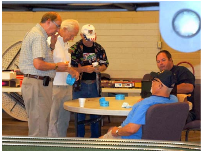
With a light meet attendance more chatting than selling was the order of the day