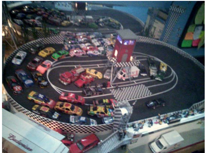
Here is something you don't see every day, a pretty good impression of Phoenix International Raceway