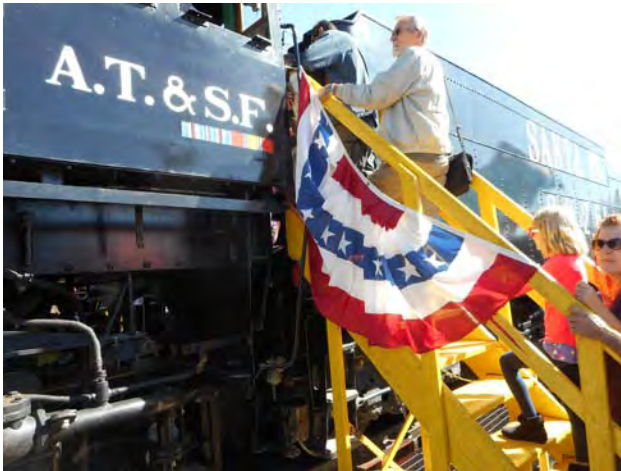
When we said next to the tender, we meant it!