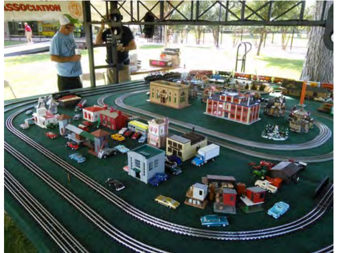
Another view of the early morning setup while we wait for power