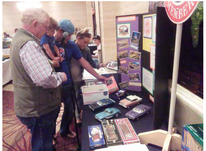
One of my best moments at the show was when I caught this young couple who won a raffle prize and were picking out a train car for their young son