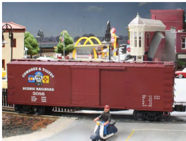
Lionel scale double sheathed boxcar featuring the Cumbres & Toltec Railroad Visit them at http://cumbrestoltec.com