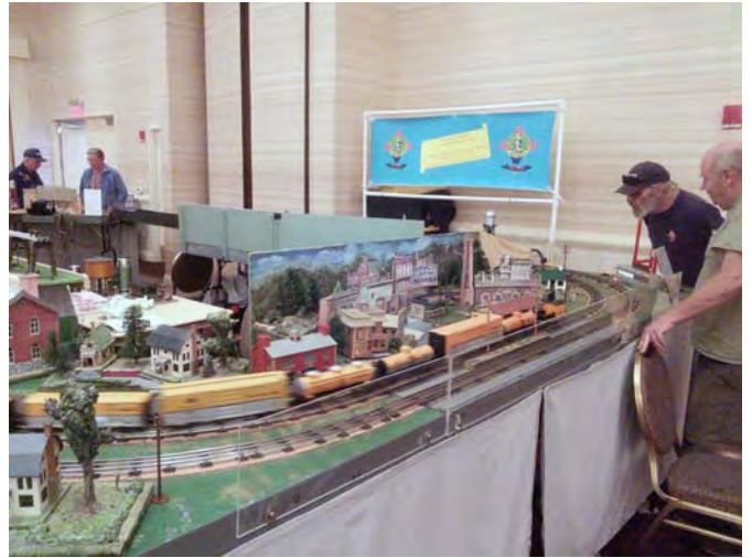
The TTOS New Mexico Division module was up and running all day to the delight of everyone