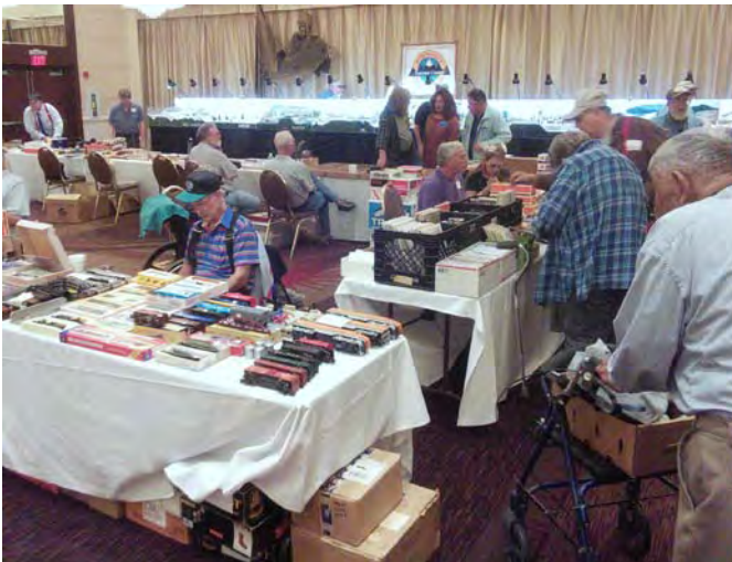
Things were busy for most of the day and I had a hard time getting away from my table to take pictures of the meet