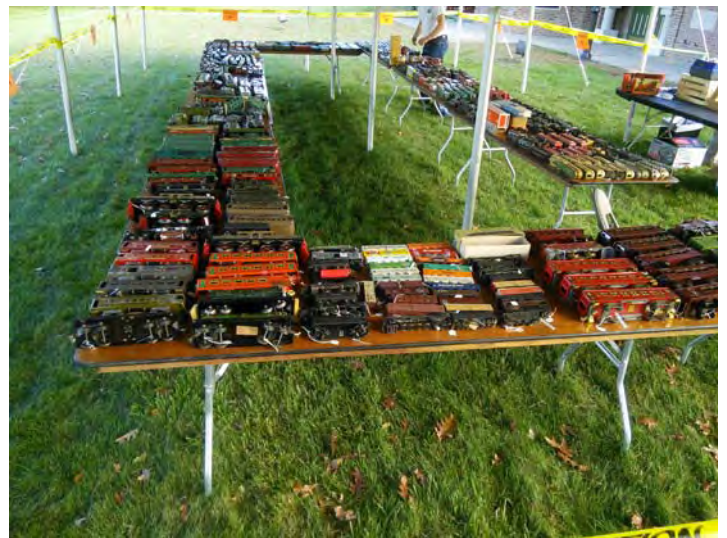
I arrived early and got a picture of the de-accession sale the Museum had. Repaints, broken or less than museum quality items were sold to help reduce storage costs

Get Your Caboose to The 63rd TCA National Convention