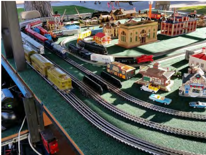
Now we are running! All five mainlines are purring along, even the old trusty #8