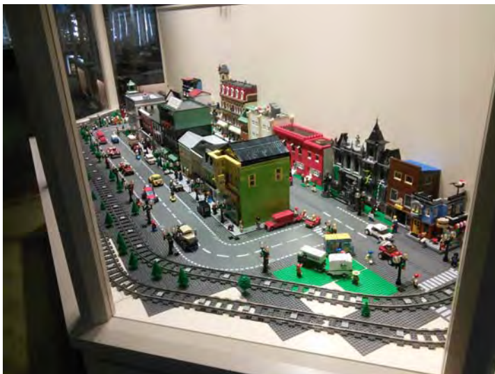
The National Toy Train Museum has a new Lego display with running trains