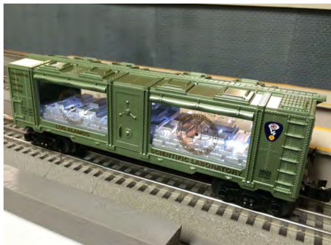
Lionel's first ever mint car with a lighted and pulsing "secret" load from the Los Alamos National Laboratory