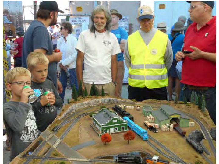
Meanwhile back at the 2926 Open House, here is another one of the module layouts that drew a lot of onlookers