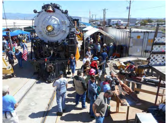
The Chapter's table was located to the right of the tender next to the container

The bank on the Santa Fe Square has had a tradition of hosting a Christmas train display for over 50 years. (Santa Fe Model Railroad Club Website) Visiting the Christmas decorated Santa Fe Square is a great family outing.