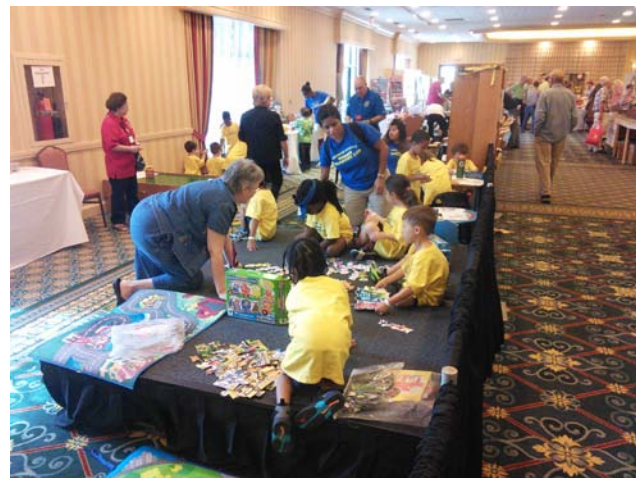
The Kids Club area was very busy on Friday. The Division contacted several Day Care centers in the area for a field trip. What a great idea!