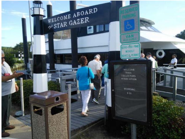
The Dinner Cruise was a wonderful evening of good friends, great food, and a quiet putt around Galveston Bay