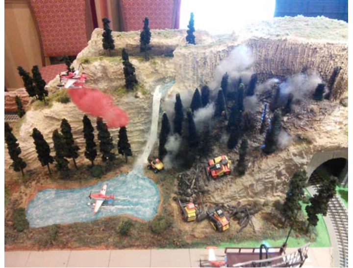
At the TCA National Convention, The North Texas Chapter had two beautiful Kids Club layouts. This one was modeled after the movie "Planes"