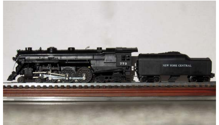
ONLY TWO MORE MEETS TO SCORE THE HUDSON HUNDRED, BUY YOUR TICKETS AT THE MEET. HUDSON DRAWING WILL BE AT THE CHRISTMAS PARTY

Get Your Caboose to The 63rd TCA National Convention Pittsburgh, PA