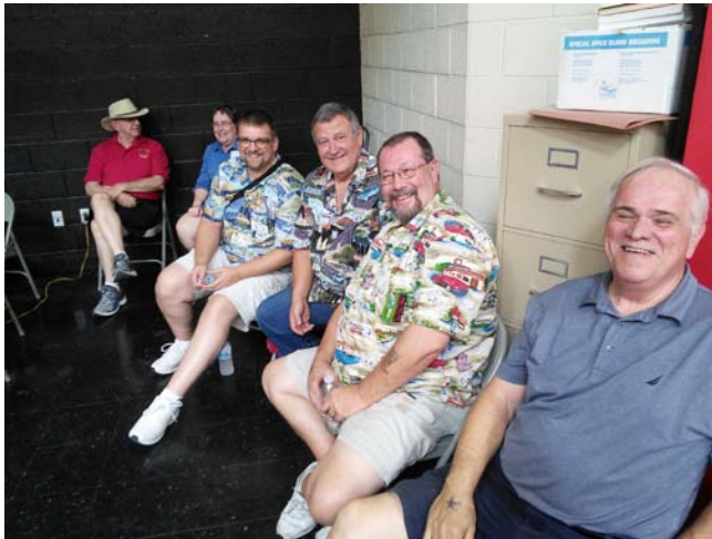
This lineup of characters were among the first to greet me at the Beat the Heat Meet