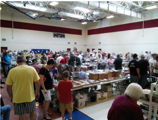
A very busy crowd early in the show, but there were still a few bargains if you looked hard enough