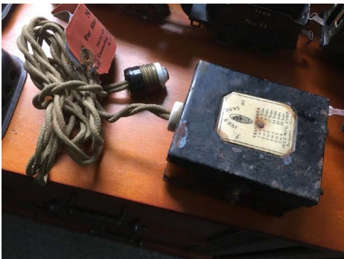
This is the transformer from the Ives set. Notice the original lamp socket on the power cord. Above right is the box end flap and right is the unusual track that came with the set