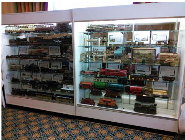
The large static display was a wonderful mixture of toy trains not only locally, but rare and unique items as well