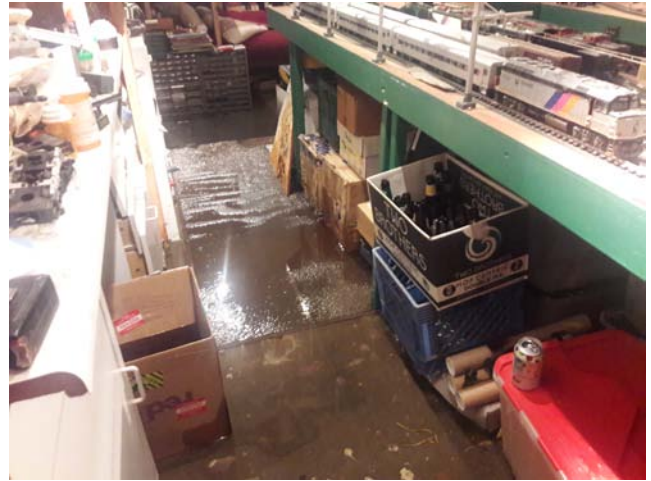
There was between 6 to 8 inches of rain runoff in the train room before the rain receded

Flood insurance, in Phoenix? On August 2 nd Central Phoenix was deluged under a slow moving monsoon storm and received 2 ½ inches of rain in one hour. Those of us who live here in the desert know the infrastructure just isn't in place for that type of "100 year" event. Maybe you remember the news with the freeways all closed because the pumps could not handle all the rain volume? Most often when the pumps can't handle the excess rain runoff the water finds it own way to lower ground through our desert streets and neighborhoods. Unfortunately past Desert Division President Jonathan Peiffer's neighborhood and home was at the center of all that as his normally quiet street become a secondary flood channel from the overtaxed storm drainage system. More importantly to our story was Jonathan's train room, although on the ground floor, also took a direct hit. "Luckily" Jonathan had flood insurance and things got moving fairly quickly. He needed his train room emptied of all the trains that were above the flood waters so the workers could remove the bad drywall and begin getting his life back on track. Jonathan put out a short notice call for help and Division members and friends came out to get the trains off the layout, into boxes and off site so the repairs in the train room could be completed. Helping that hot & humid afternoon was Dwane Turner, Angelo Lautazi, Bill Lazenby, Bruce Keech, Katie Elgar, Dallas Dixon and Chris Allen.