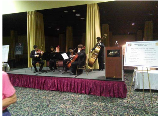
The Wednesday night Welcome Party featured a variety of live musical entertainment including this classical High School quintet