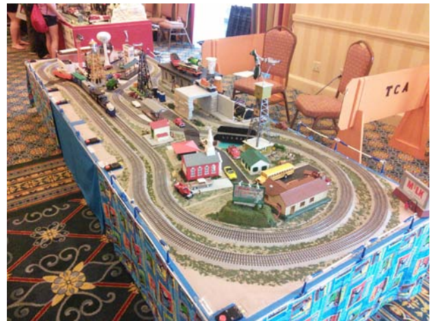
I loved all the operating layouts; I lost count of them all. This one is from the Gulf Coast Chapter